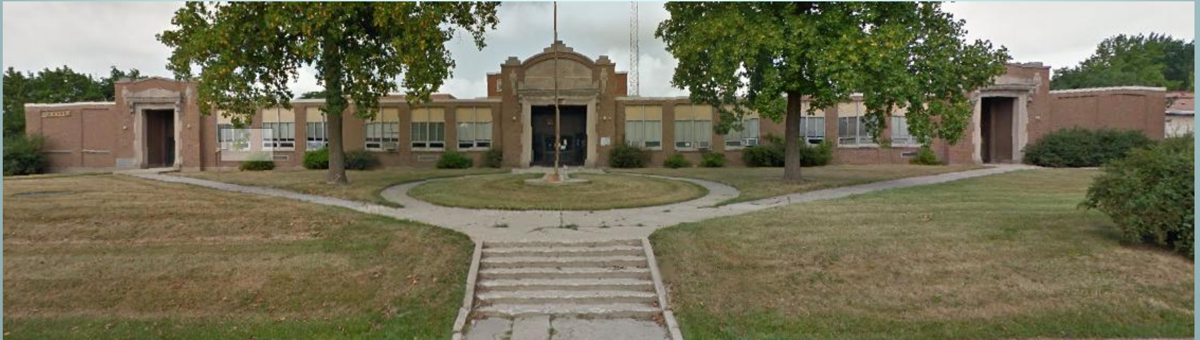
This is the view from the front on St Mary's Avenue