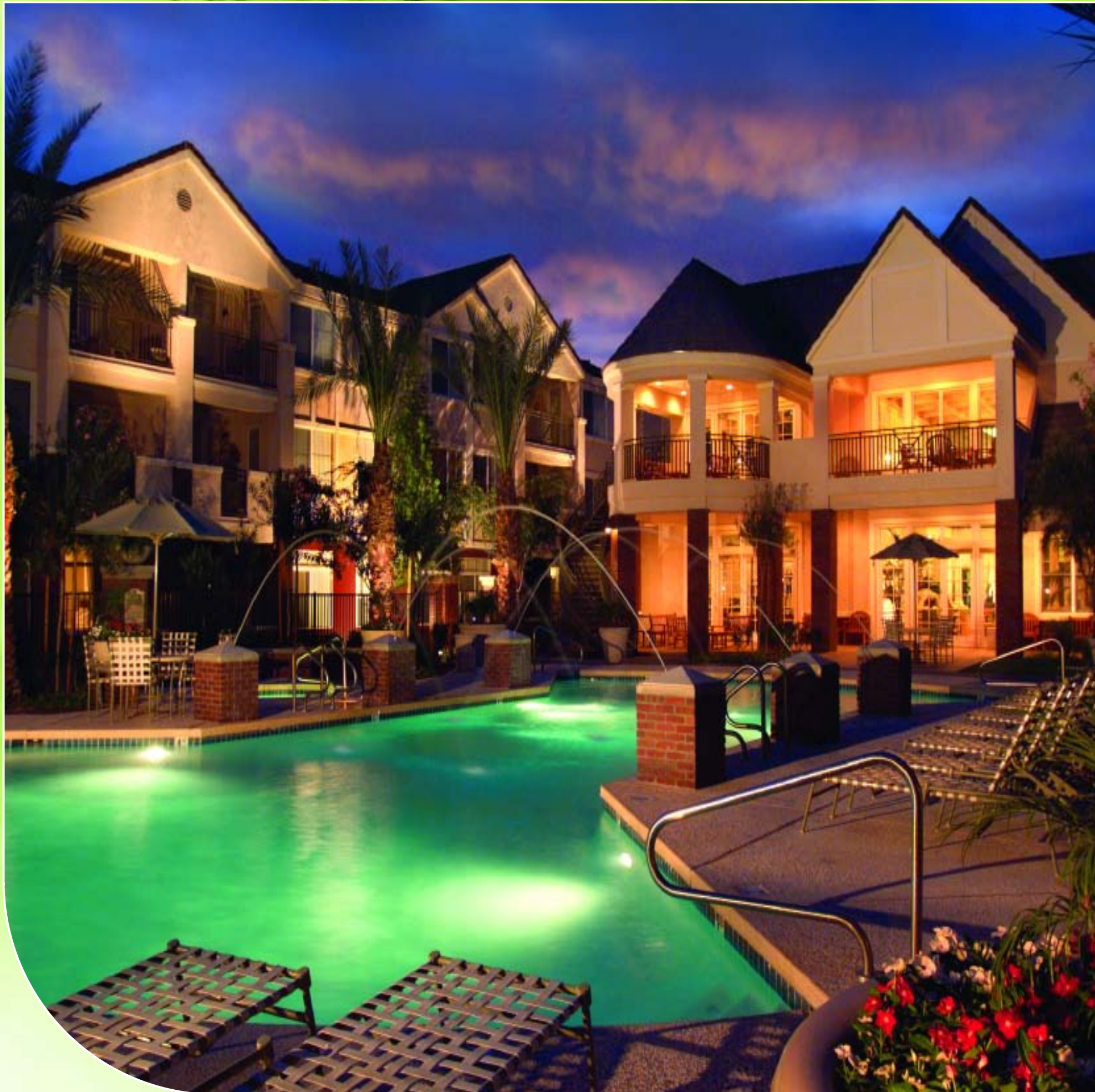
After dark, the pool and clubhouse house at Citi get revved up and turned on. The clubhouse is ready for entertaining, relaxing or a just a fun night with the kids.