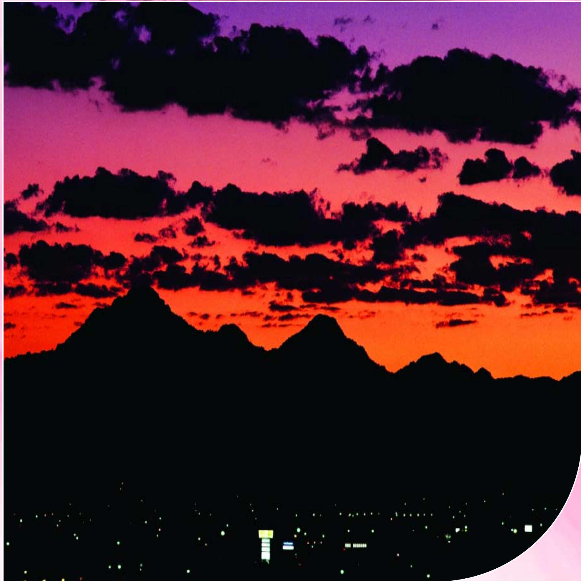
The sun sets behind the mountains near Phoenix, Arizona as the city springs to life.