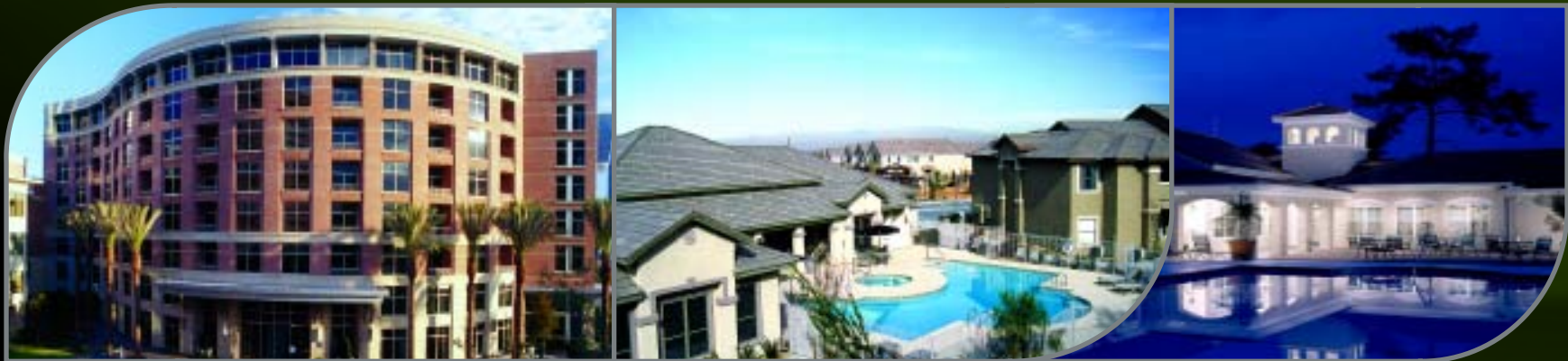
THE LOFTS ON POST OAK • HOUSTON, TX TRAVERSE, HENDERSON • LAS VEGAS, NV THE ENCLAVE • TAMPA, FL