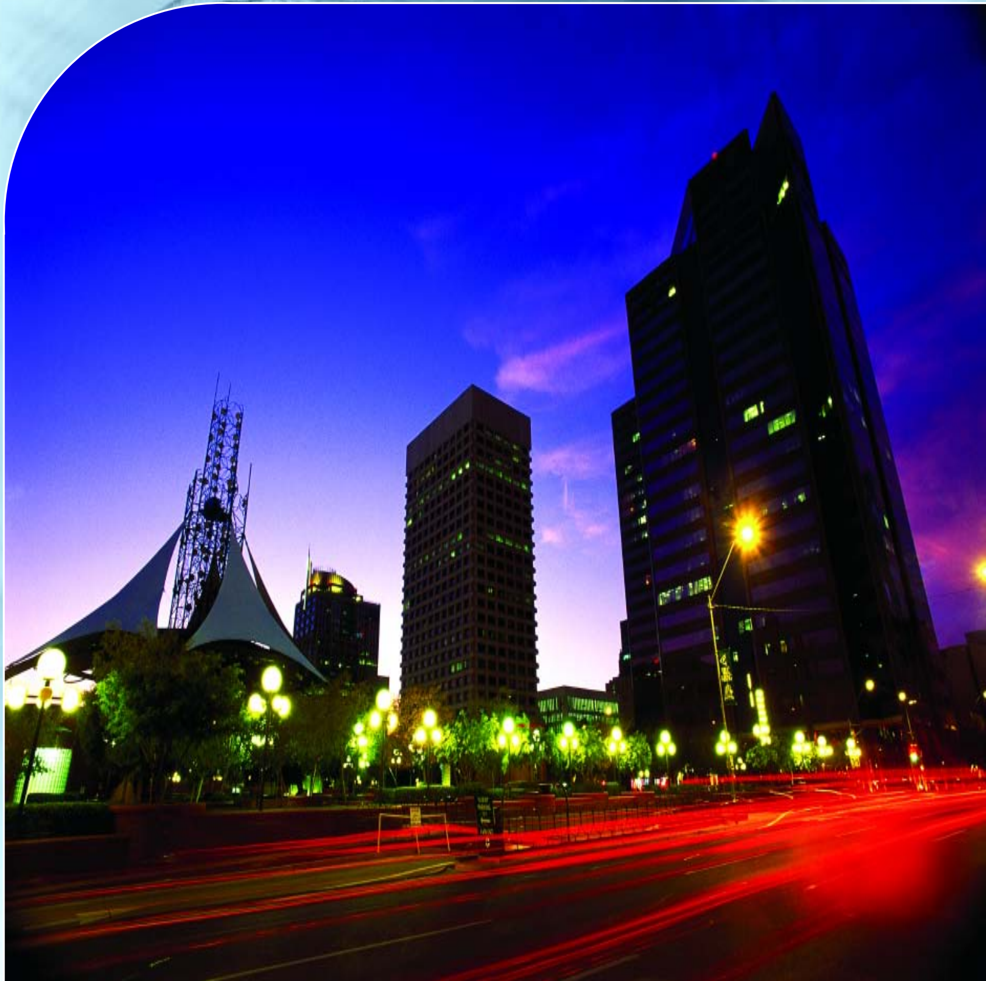
When the sun goes down the lights come up, as downtown Phoenix rises near the Patriot's Park & Cultural Center complex.