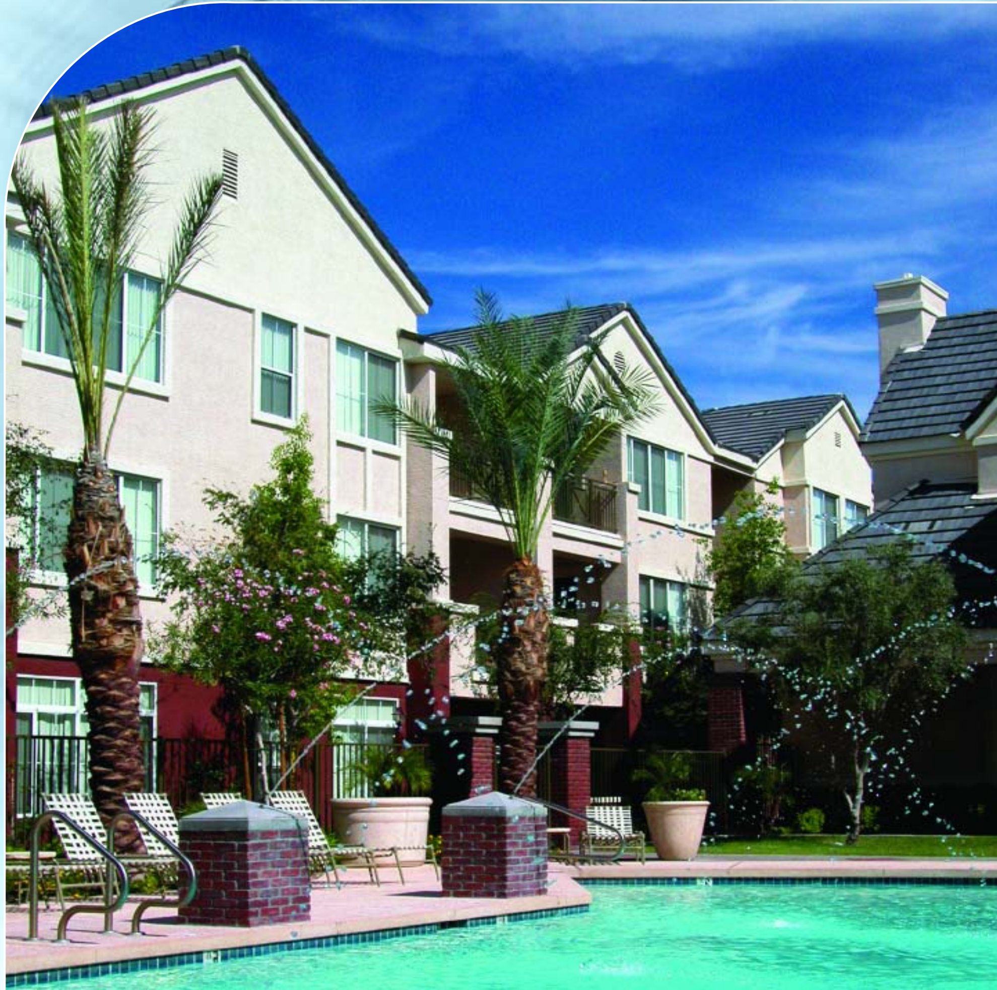
The pool fountains at Citi put on an impressive and inviting display during the warm Arizona summer.