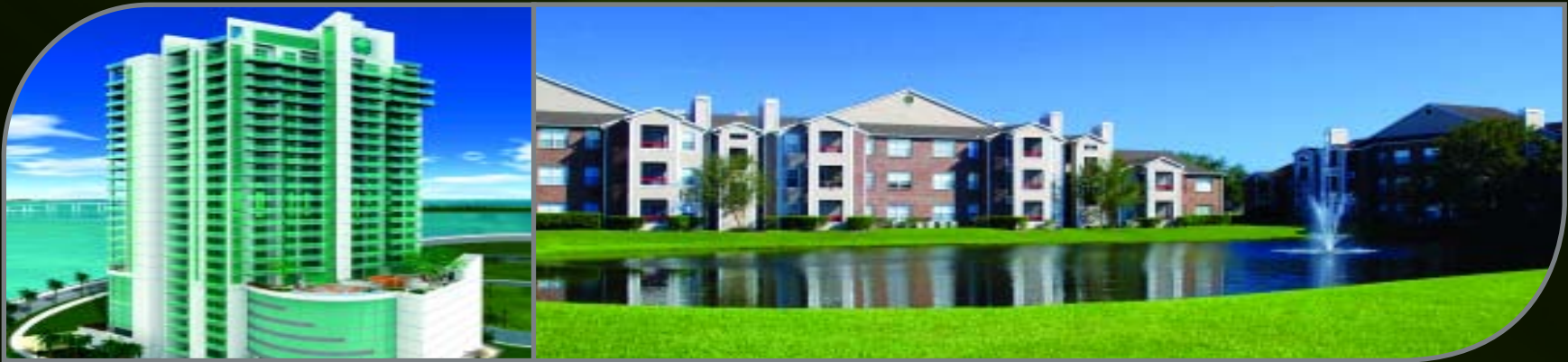
EMERALD AT BRICKELL • MIAMI, FL

For every market and project, Sunvest assembles the most talented team of respected industry professionals to help carry out their vision. In addition to the in house core group of seasoned veterans, Sunvest engages experts in their respective fields such as lawyers, architects, general contractors, property managers, mortgage lenders, title companies, condominium association managers, interior designers, specialized sales and marketing companies, advertising and public relation agencies. This highly experienced team of professionals allows Sunvest the ability to adjust quickly to market and economic shifts.