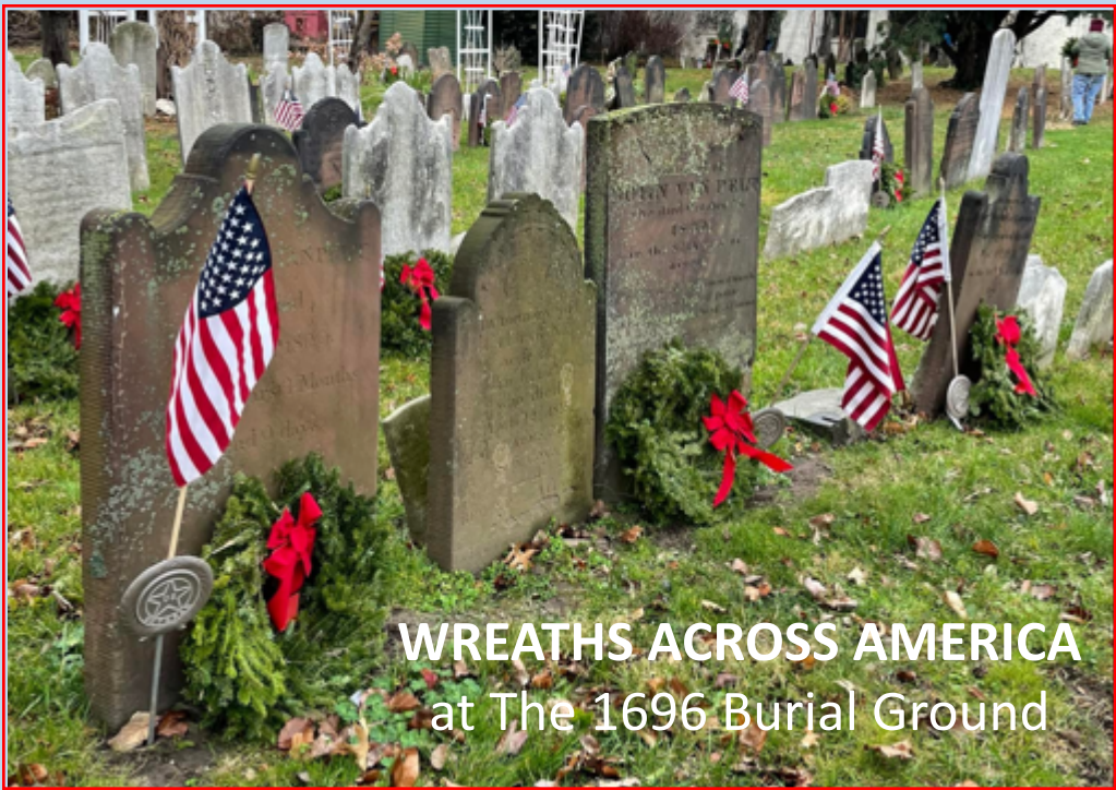
WREATHS ACROSS AMERICA at The 1696 Burial Ground