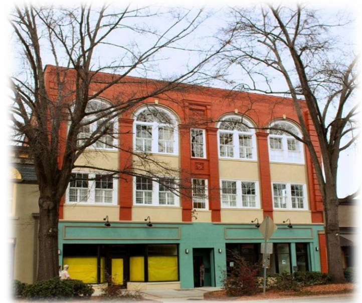
The Baldwin Lofts – Milledgeville, Georgia