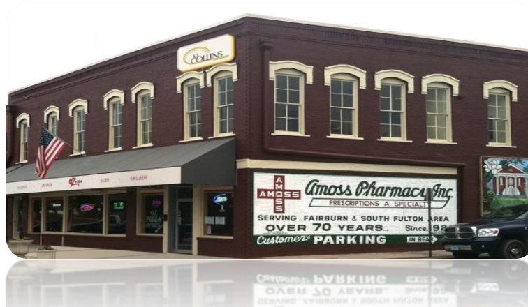
Amoss Pharmacy Building – Fairburn, Georgia