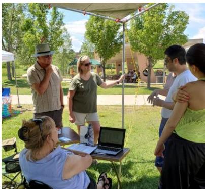
Getting connected and hiding out in the shade