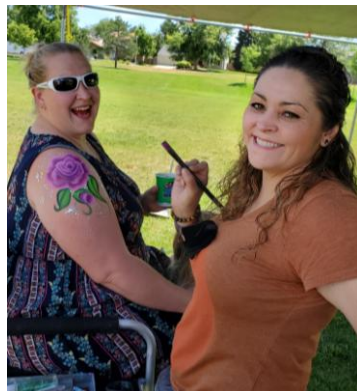
Special thanks to Sugarlips Face Painting for the brilliant artwork!