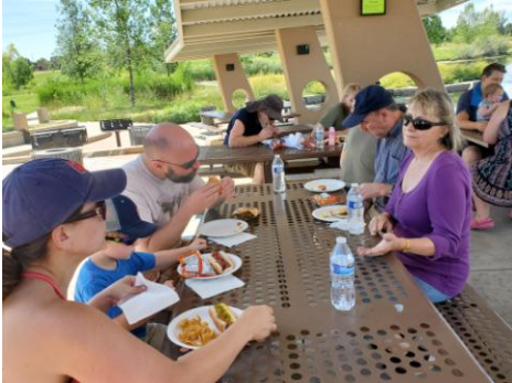
Neighbors enjoying a bite to eat