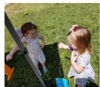
(left) A nice sunny day for a picnic