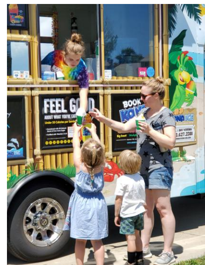
Snow cones from Kona Ice took the edge off the heat