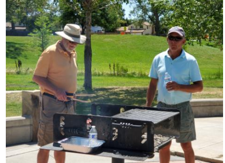
Grillmasters hard at work