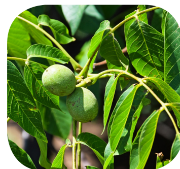
Leaves and fruit of a black walnut.