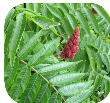
Leaves and seed head cluster of staghorn sumac.