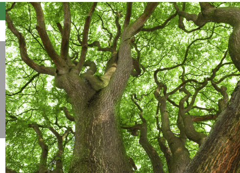
Tree of Heaven ( Ailanthus altissima )

Proper identification of tree of heaven is important in helping to eradicate this invasive pest. Although tree of heaven is an invasive plant, there are several native trees that are similar-looking. It's important to distinguish these from tree of heaven so that these look-alikes are not removed.