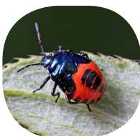
Stink Bug (nymph)