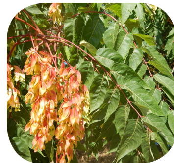
Leaves and winged seed pods of tree of heaven.