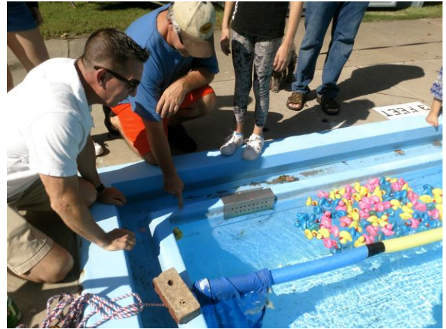
We have a winner!