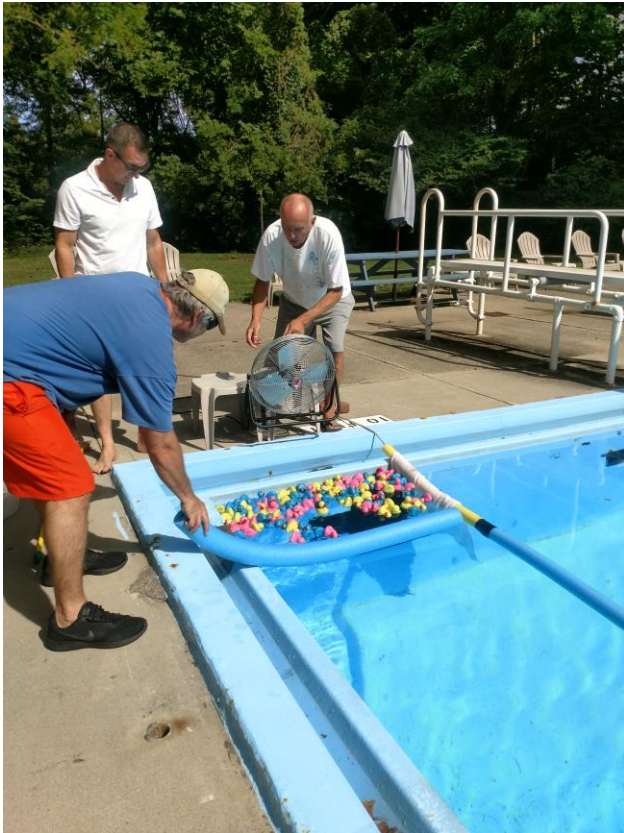
Duck race, at the starting gate