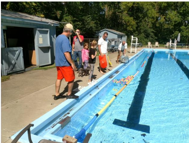
Down the stretch they come