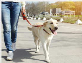
Happy dog--responsible owner.

or on the side of someone's yard. Yep, that has happened quite often of late! Was that you? We hope not!