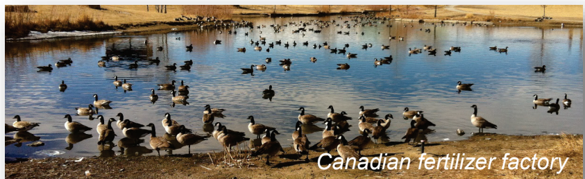
Canadian fertilizer factory

The Dumb Friends League accepts all dogs, cats, and small mammals (mice, rats, hamsters, Guinea pigs, gerbils, rabbits, ferrets, chinchillas, and hedge hogs). If they come in lost and found and have no tags or microchips, they go up for adoption after 5 days. If they have tags or microchips, they don't go up for adoption for 10 days and only after all attempts have been made to contact the registered owner fail. ☘