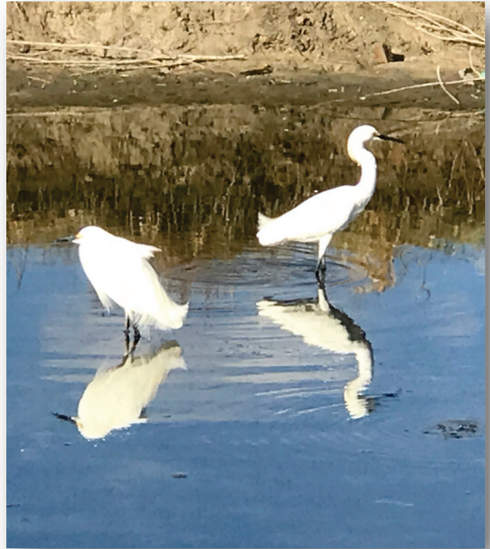
Spring is in the air. Birds and bees start pairing off at Utah Park.

Just play it safe and exit to the north where traffic is controlled by the light on Havana and Idaho Pl. It also has a left turn arrow if you want to go north on Havana. There is also a right turn only exit onto southbound Havana just to the south of Costco's fueling station. It is still safer to use the light on Havana and Idaho Pl. exiting out of Costco to the north. ☸