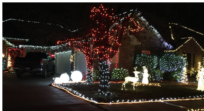
11600 NW 5TH

A Friendly Reminder If you haven't removed your Christmas Decorations yet, please do.