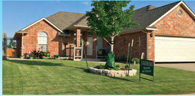
JUNE - TOBY & KIMBERLY