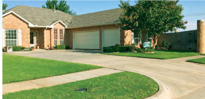
JULY - TERRY & RITA