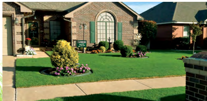
SEPTEMBER - CHRISTIAN & LORI