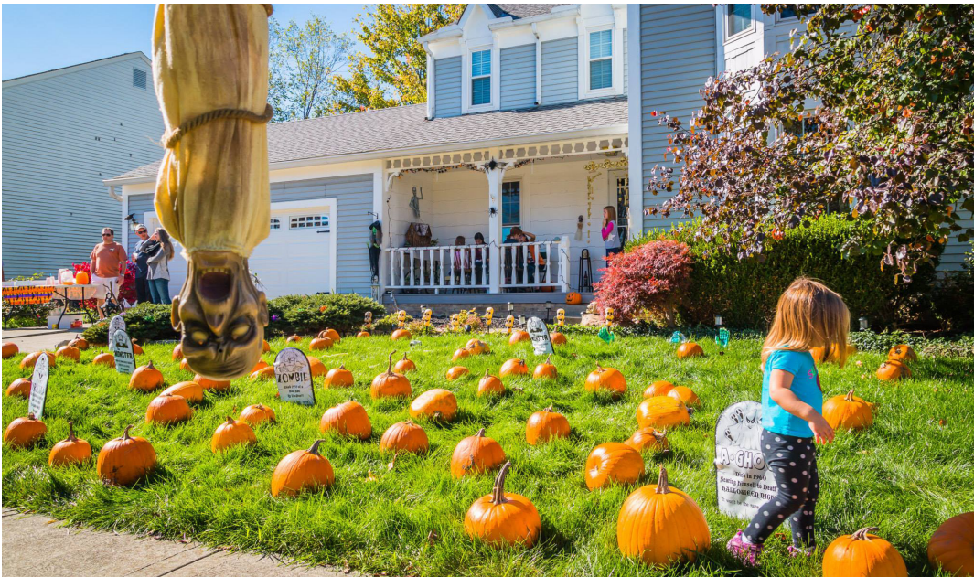
The Pumpkin Drop will be on Bear Tooth Court on Sunday, October 25. Please pay your annual $20 dues to be entered in our Membership Contest drawing to win a $25 gift certificate.