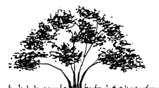
Chaparral Plant After Pruning

Step 4: Dispose.... of the cuttings and dead wood by either hauling it to a landfill; or, by chipping/mulching it on-site and spreading it out in the Zone 2 area to a depth of not more than 6 inches.