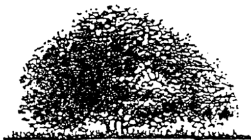
Chaparral Plant Before Pruning

Remaining plants, 4-ft or more in height, should then be cut and shaped into “umbrellas.” This means pruning one half of the lower branches to create umbrella-shaped canopies. This allows you to see and deal with what is growing underneath. Upper branches may then be shortened to reduce fuel load as long as the canopy is left intact. This keeps the plant healthy, and the shade from the plant canopy reduces weed and plant growth underneath. Vegetation that is less than 4 feet in height, like coastal sage scrub, should be cut back to within 12 inches of the root crown.