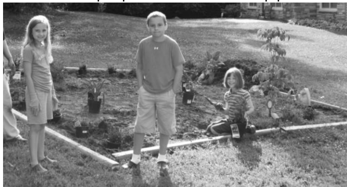
Even the kids are getting involved planting pink for the Dogwood Trail! (Feature Trail in 2015)