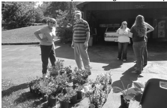
About 25 people turned out to swap plants.