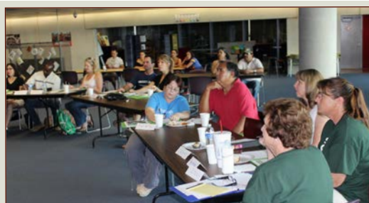
Residents participated in Neighborhoodology earlier this year.

end of this year, more than 30 community leaders from eight neighborhood organizations will have successfully participated in Neighborhood College's Neighborhoodology.