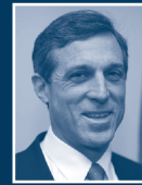
U.S. REPRESENTATIVE JOHN CARNEY