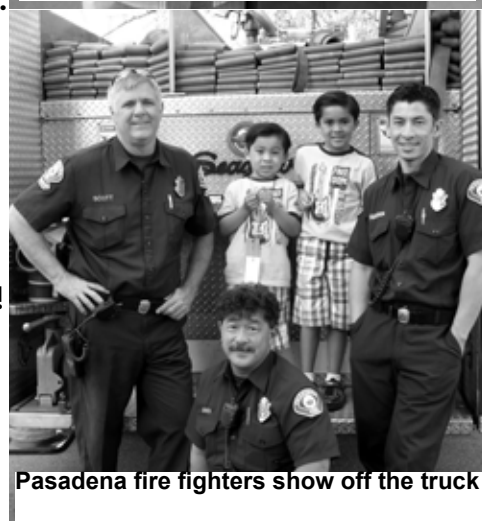
Pasadena fire fighters show off the truck