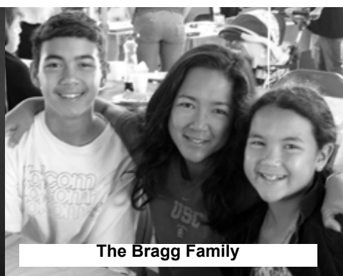
The Bragg Family