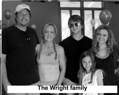
The Wright family