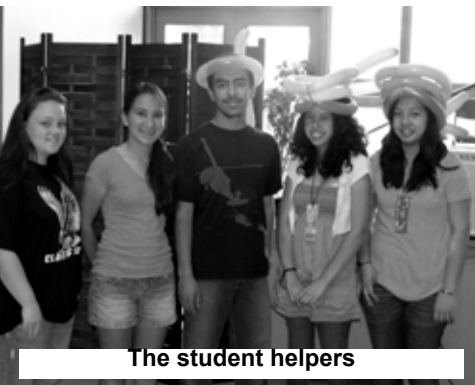
The student helpers