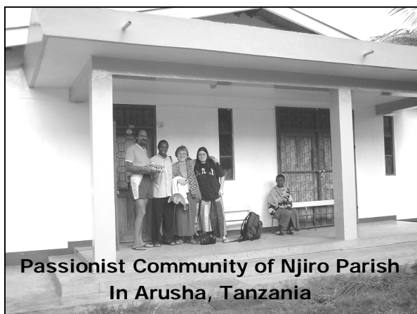
Passionist Community of Njiro Parish In Arusha, Tanzania

Our travels took us to Arusha in northern Tanzania near Mt. Kilimanjaro. We got the opportunity to visit a seminary at the Passionist Community of Njiro Parish and we visited a family in the jungle in Kilema! We also visited Morogoro which is near the capital city of Dar Es Salaam along the coast. Mgolole Convent and Orphanage was among the various stops we made in the Morogoro area. We also visited Kihonda Parish and St. Monika's Primary School where your donations to Helping Hands Healing Ministries, Inc. provided $1,500 for student desks needed for the expansion of the school. We also visited several seminaries in the Dar Es Salaam and Morogoro dioceses.