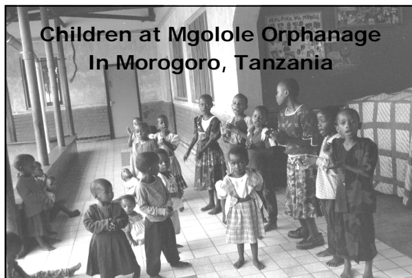
Children at Mgolole Orphanage In Morogoro, Tanzania