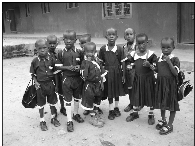
School children at Kihonda Parish

We have so much to learn from the warmth, love, respect, pride, and inner strength, of these people. They welcome us without condition. They care for and support each other without condition, and would include us in a moment should we so need or desire.