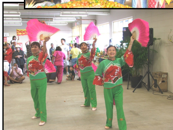
New Year excitement at the marketplace