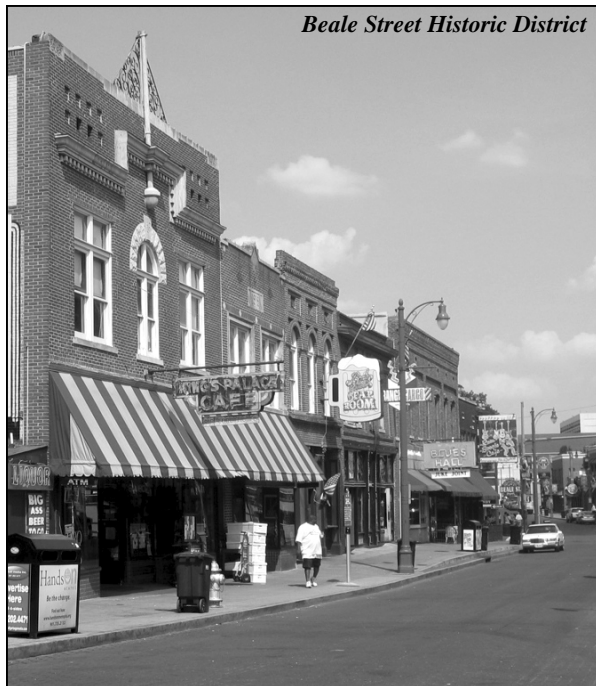
Beale Street Historic District