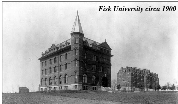
Fisk University circa 1900