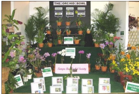
2009 TBOS State Fair Display "Touchdown Tampa Bay" An Orchid Fan Fest