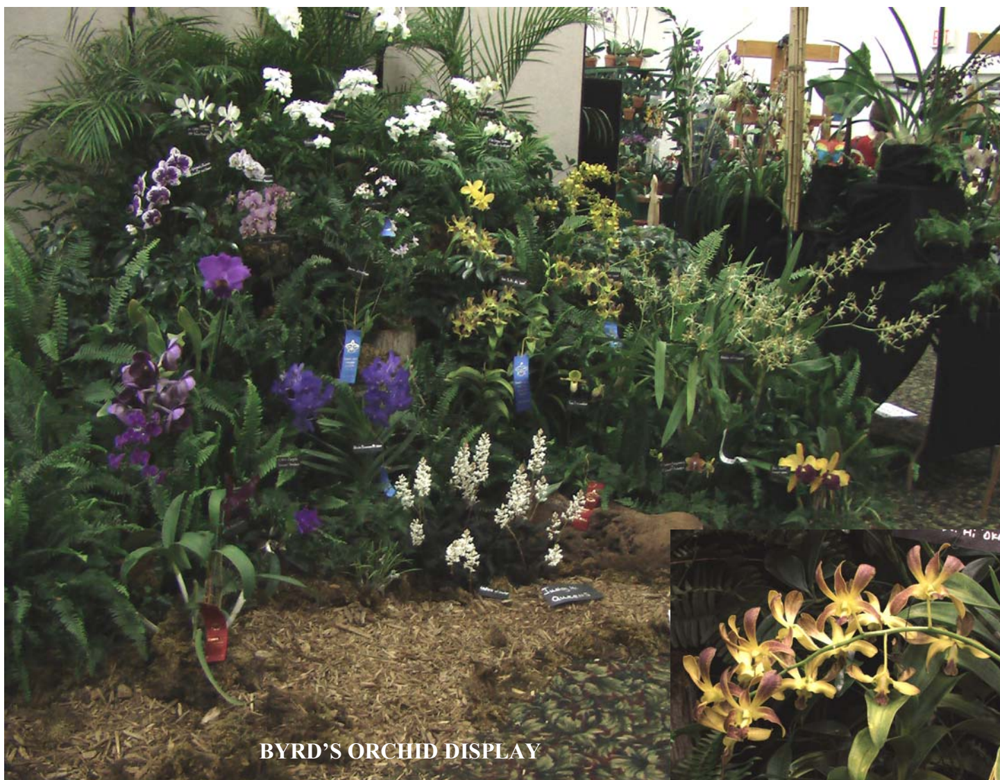
BYRD'S ORCHID DISPLAY