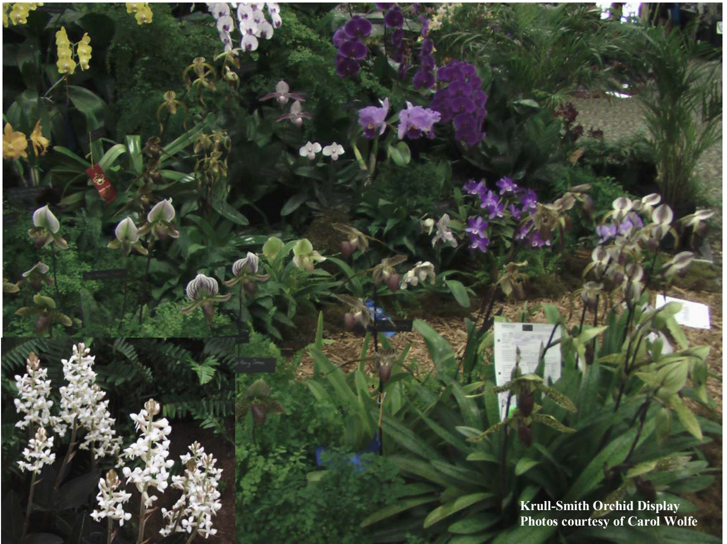
Krull-Smith Orchid Display