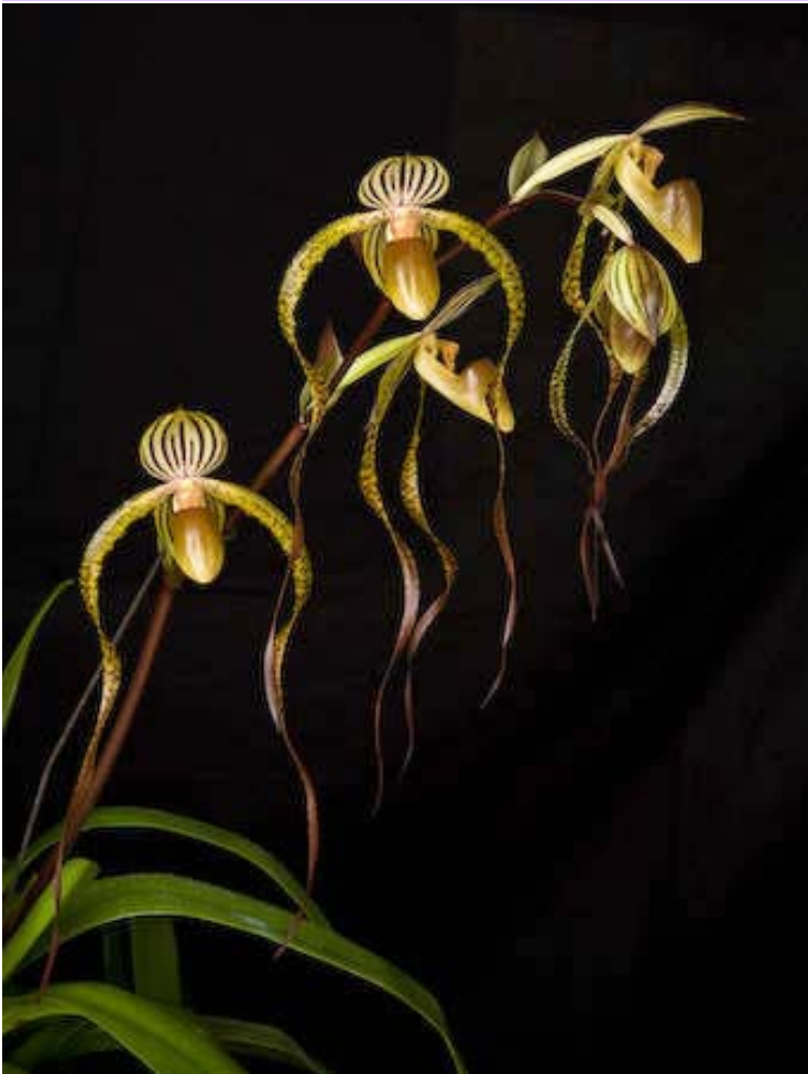
2008 AOS Award