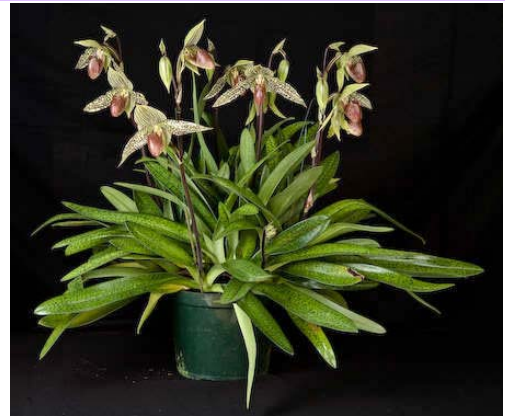
2008 AOS HCC Award