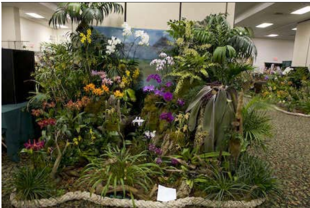
2008 Best Display at Show