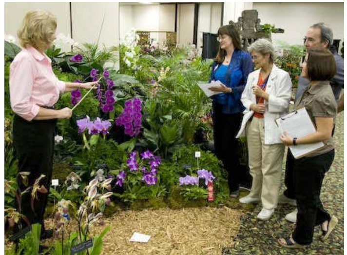
Clerks and Judges studying orchids