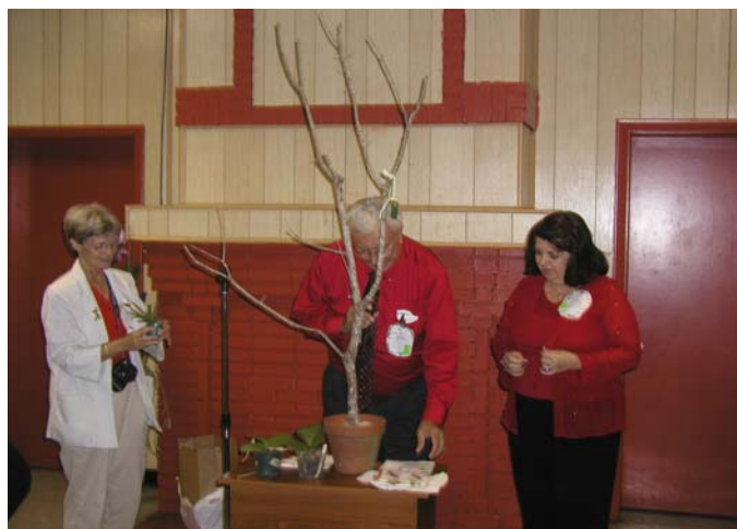
Christmas Celebration Photos