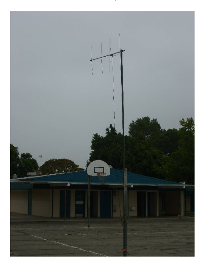
TWO METER YAGI FOR ECHOLINK