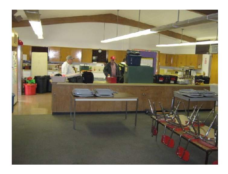
THIS IS THE FIRST TIME WE HAVE SET UP OUR JOTA IN A CLASSROOM!