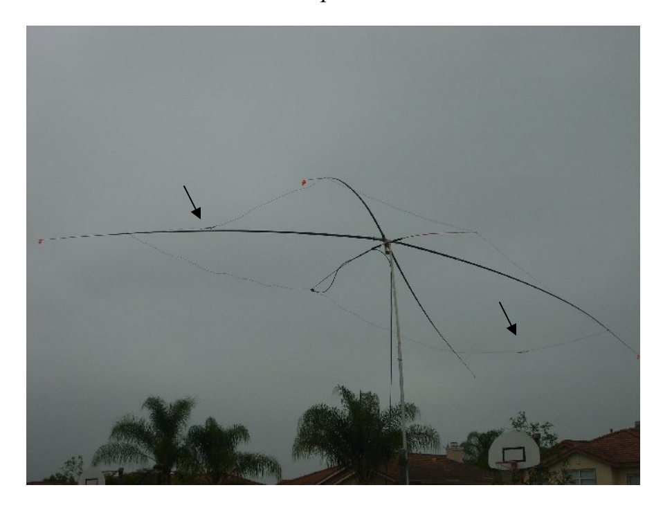
This is a two element beam. Arrows point to insulators that separate the elements