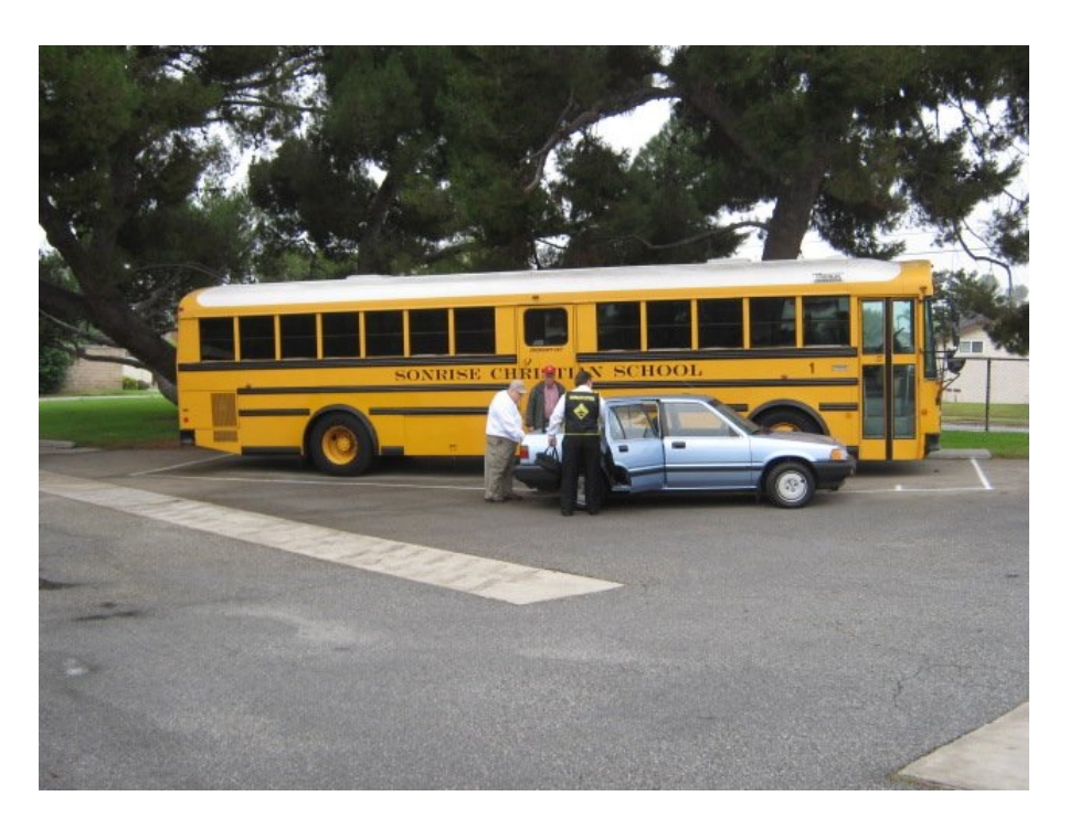
UNLOADING THE RADIOS!