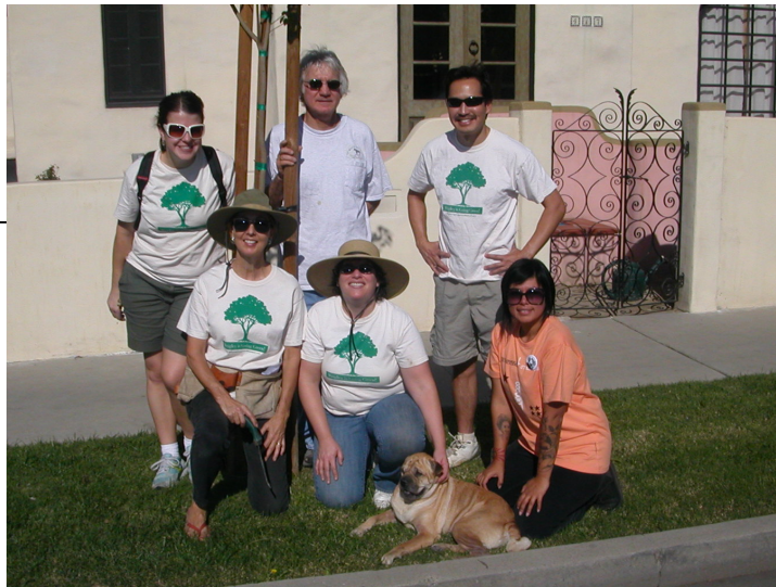
Picture from a previous tree planting