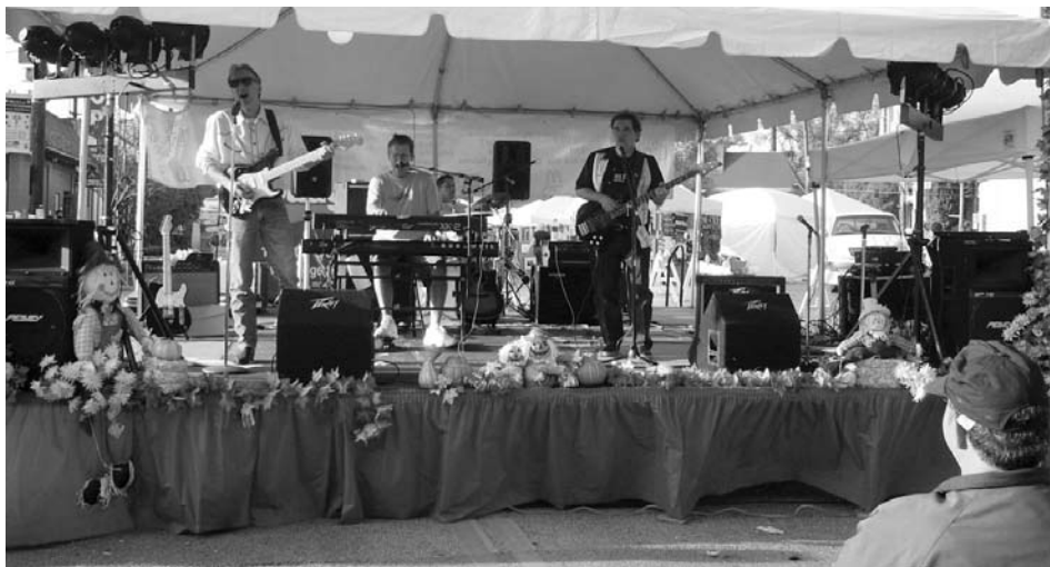
Belknap's own legendary rock and roll ensemble, Earbone, have added Belknap residents and are now calling themselves Binding Elements.