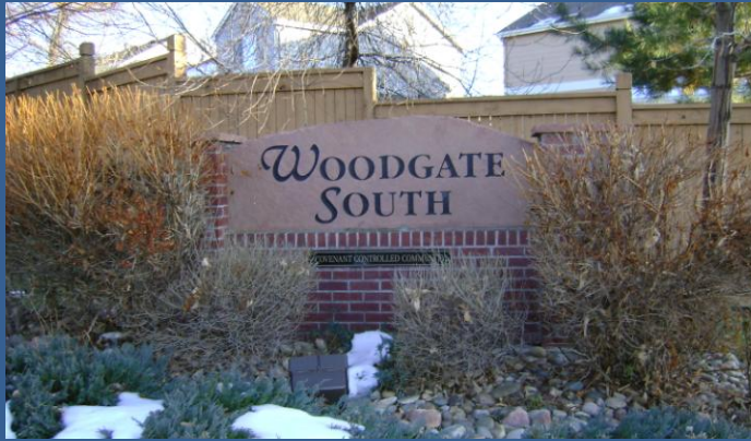
Woodgate South Aurora, CO