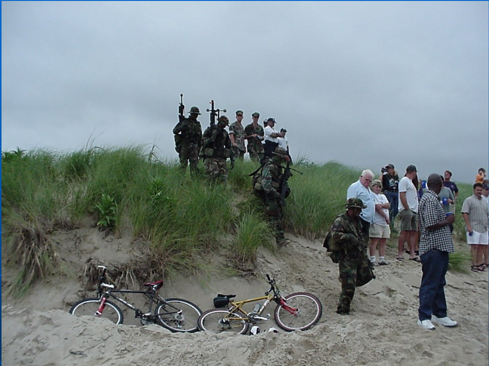
SEAL Squad walks down hill to beach