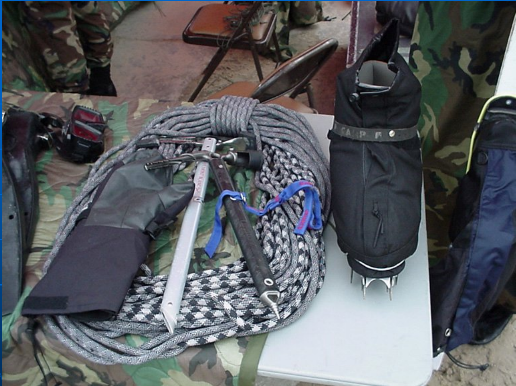
Snow climbing gear