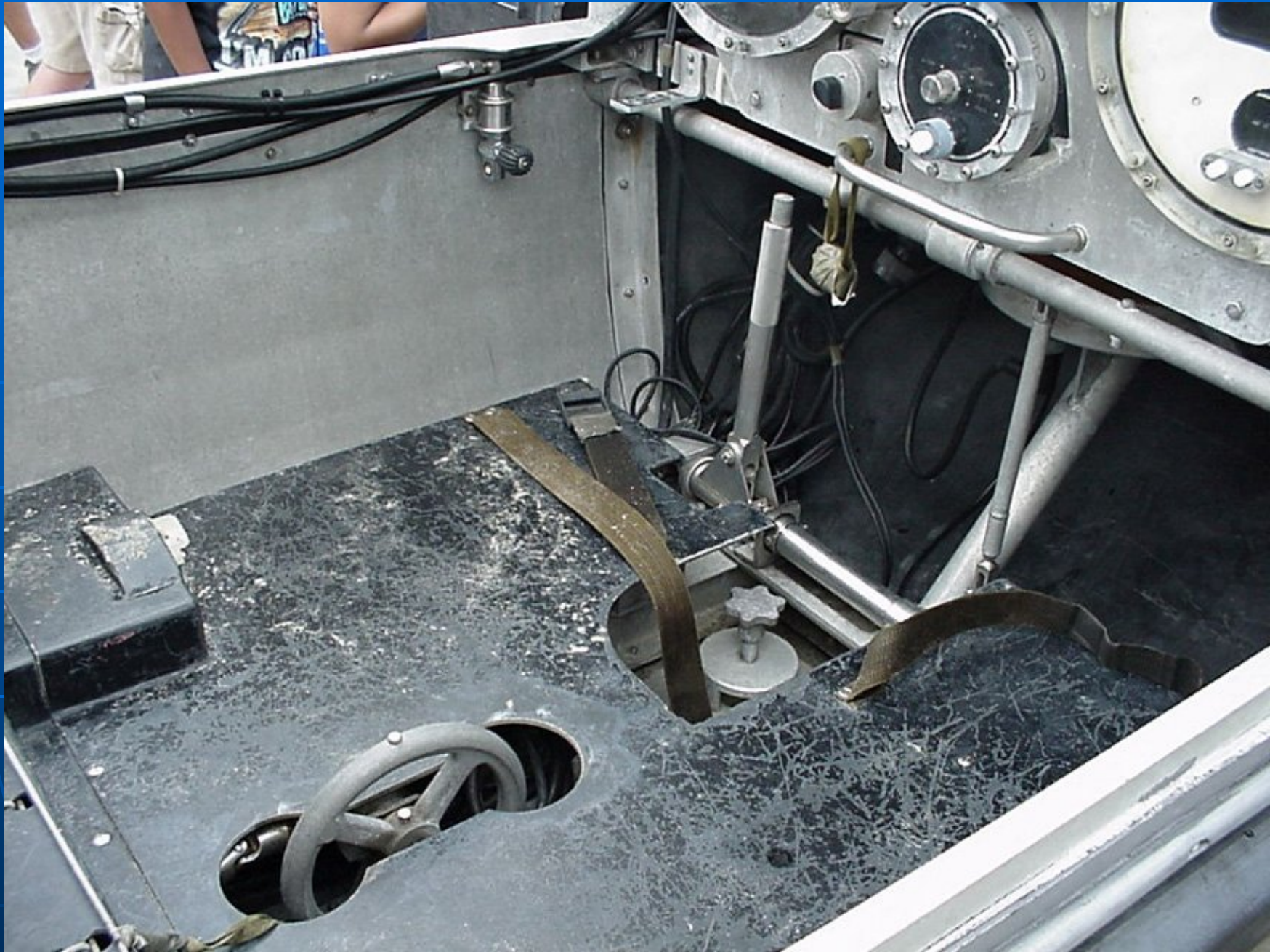
Forward compartment deck (note trim wheel in the center)