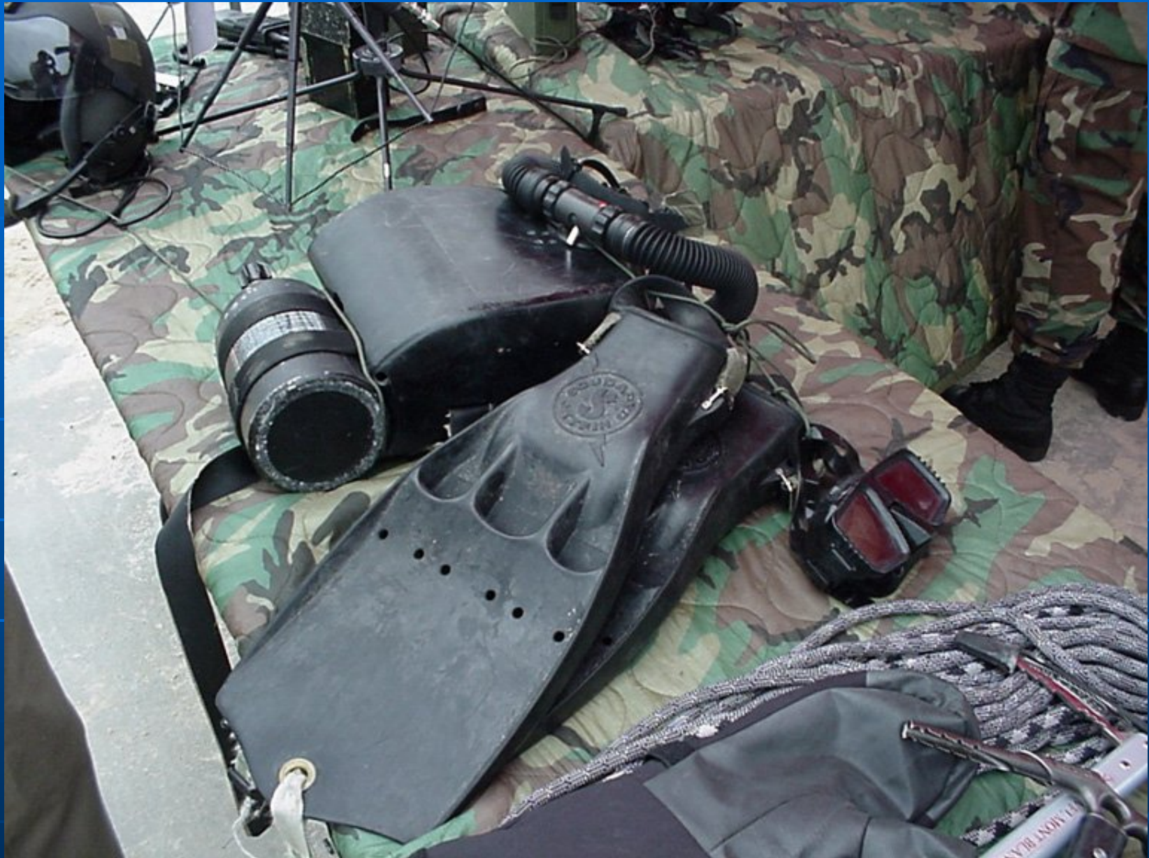
Draeger rebreather, fins, mask