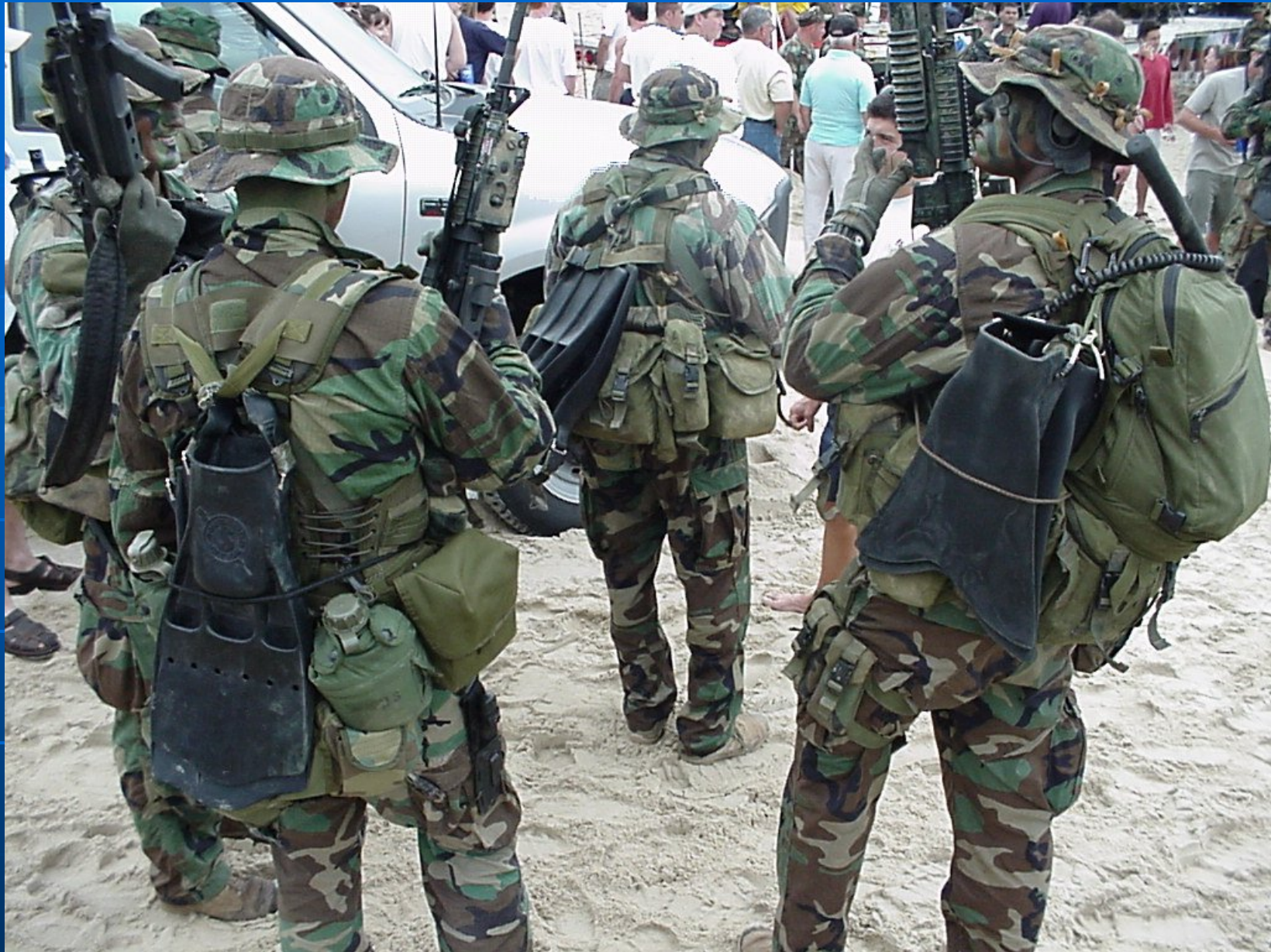
Four SEALs, View of Gear and Fins (note the wide variety of individual gear)