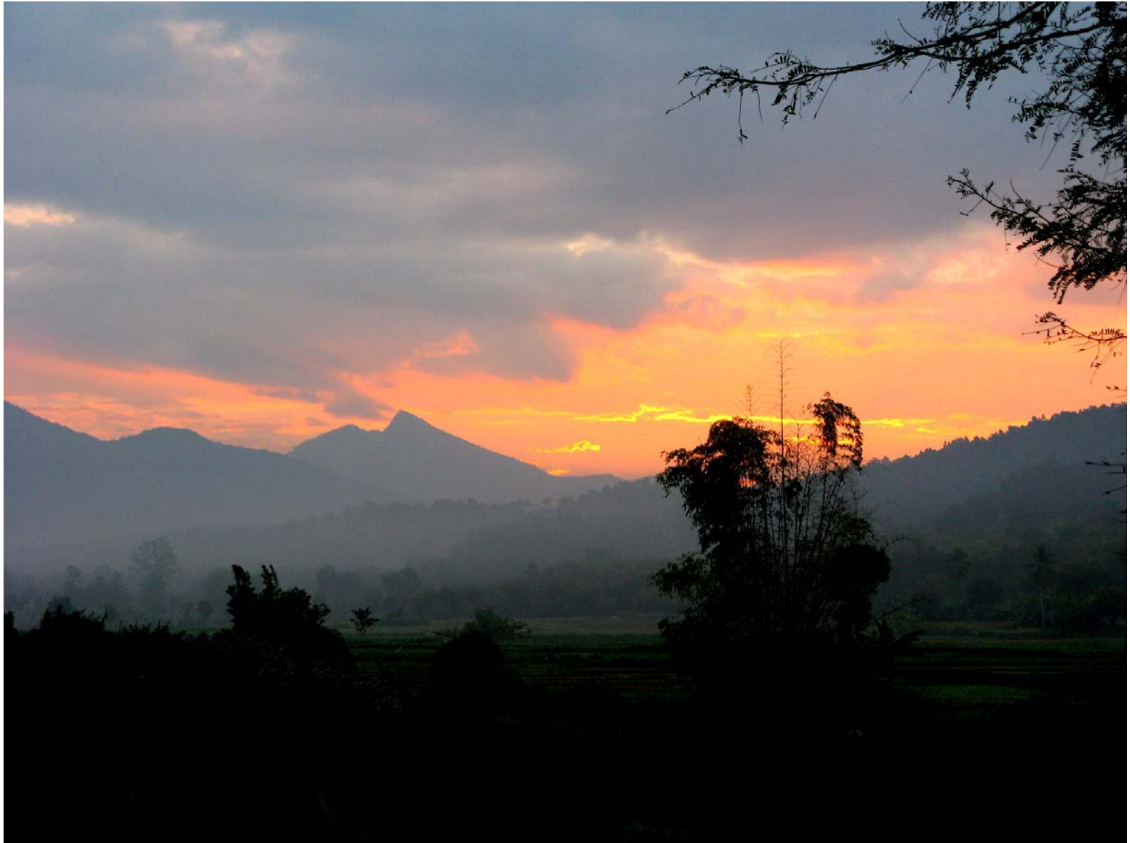
Doi Phu Kha with Red Rising Sun