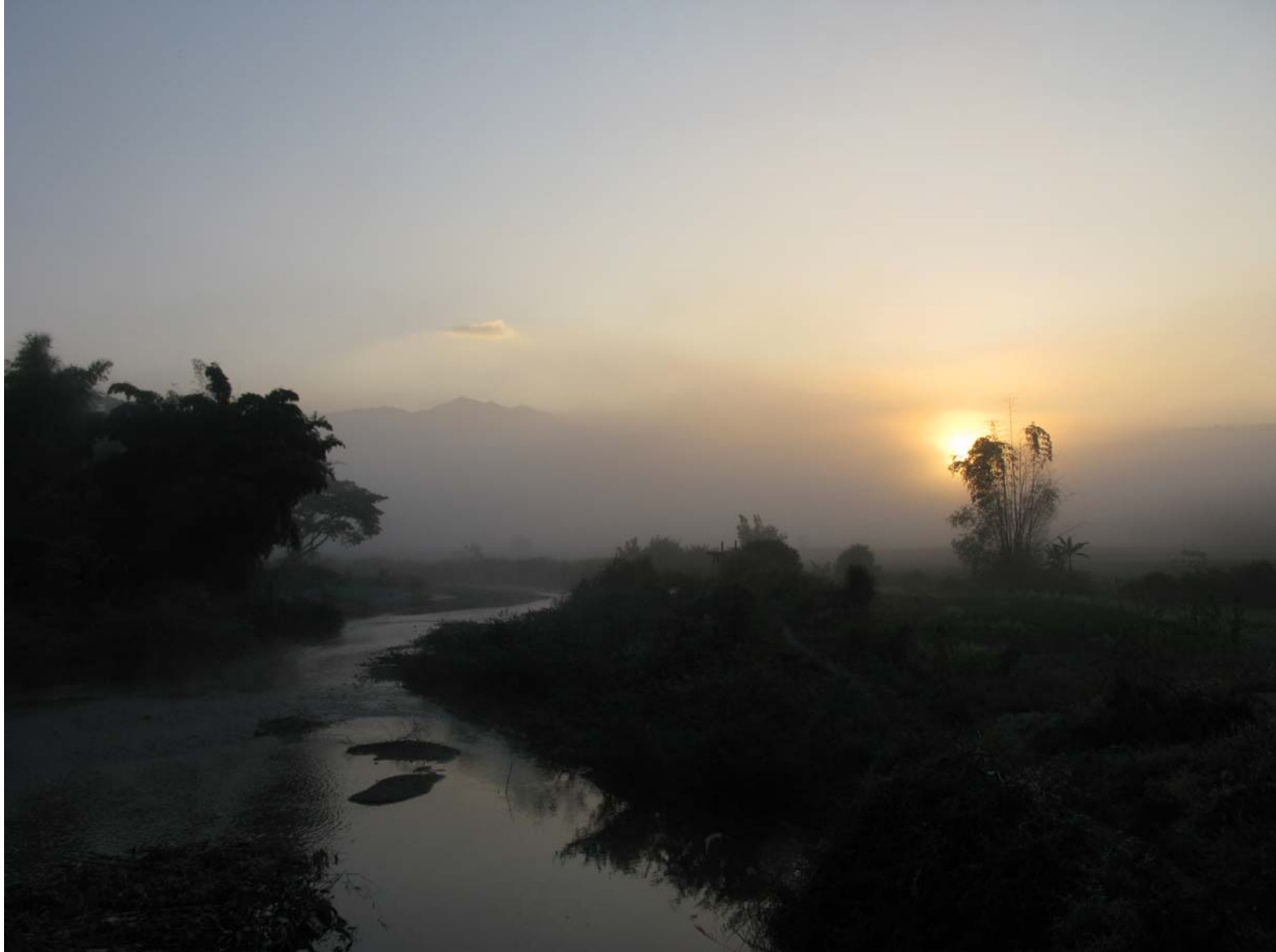
Nam Yang with Morning Sun and Fog