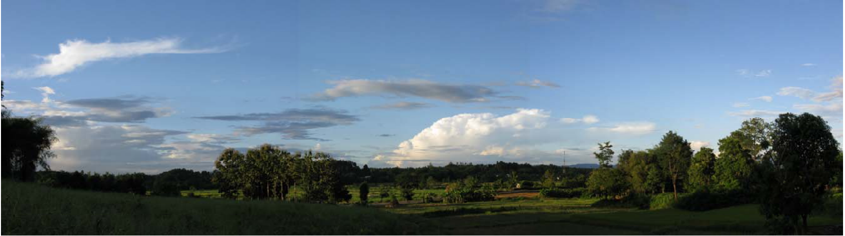
Sky over the Nam Yang Valley looking north from our farm.