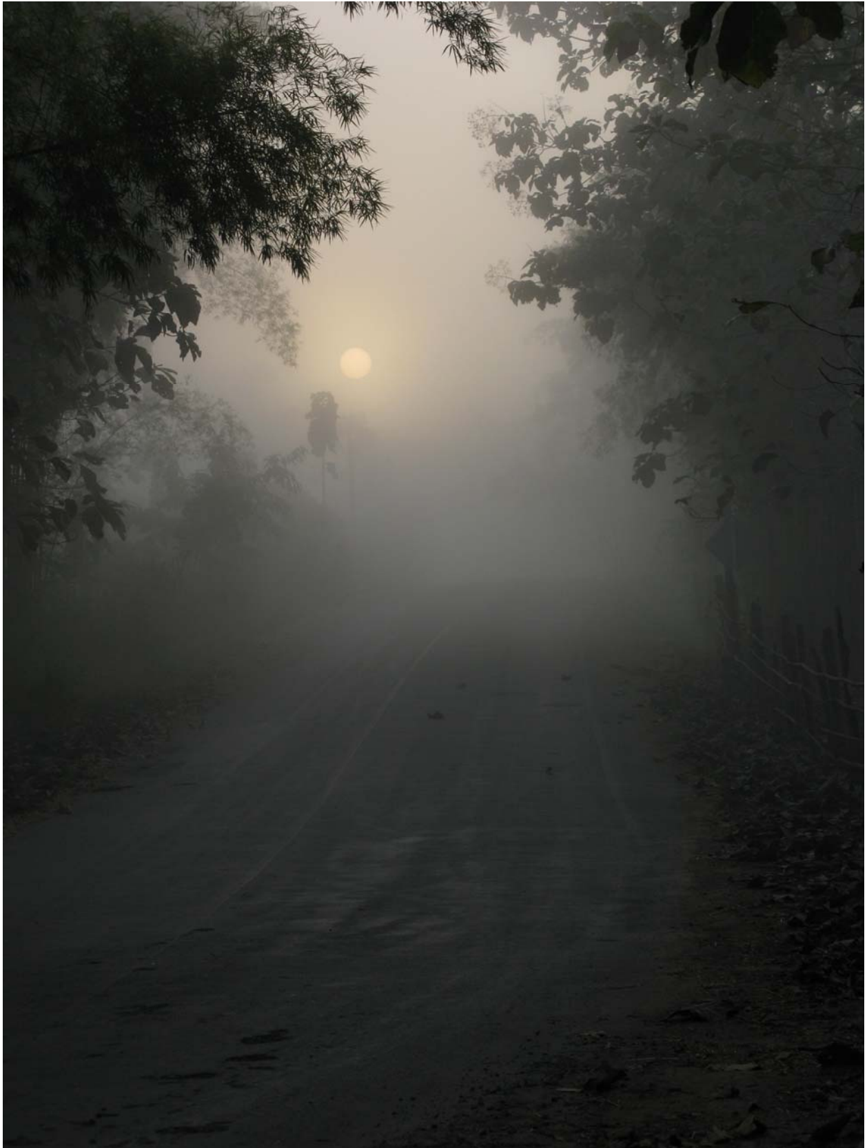
Misty Morning Farm Road