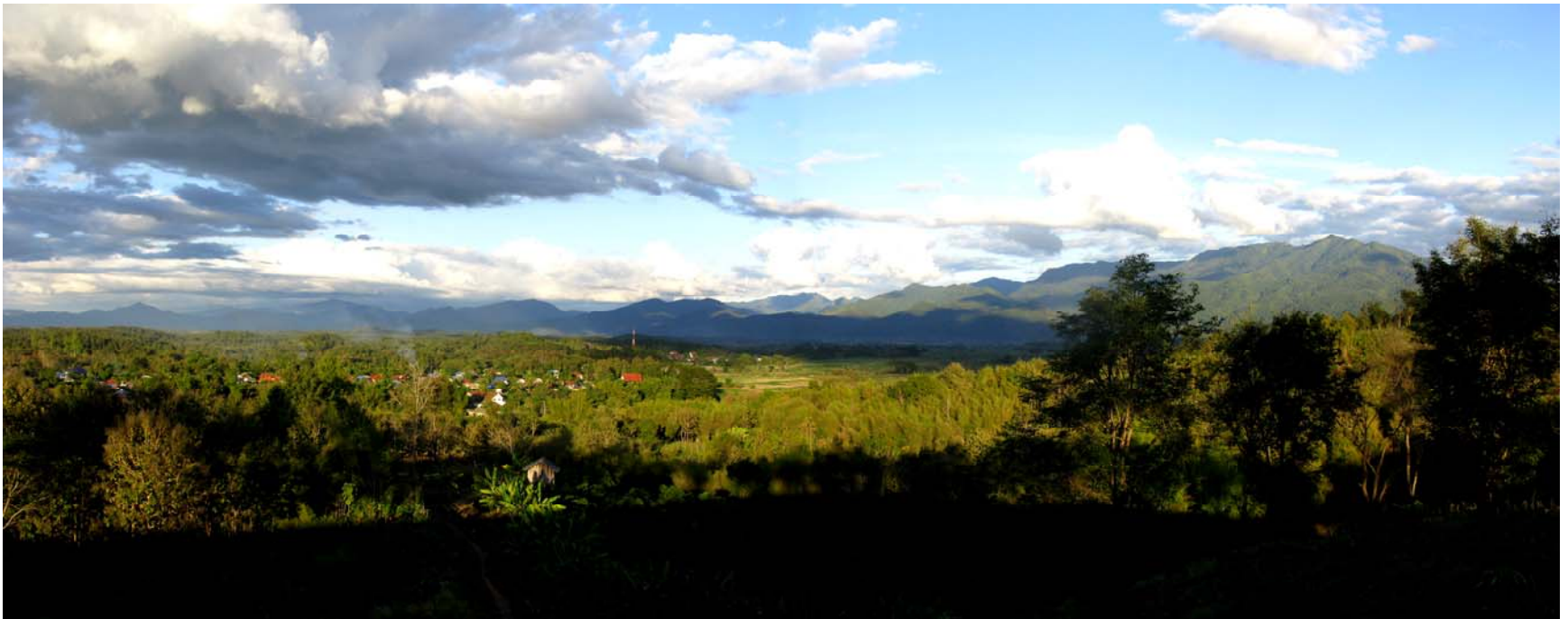
View of Ban Na Fa and the Eastern Nam Yang Valley