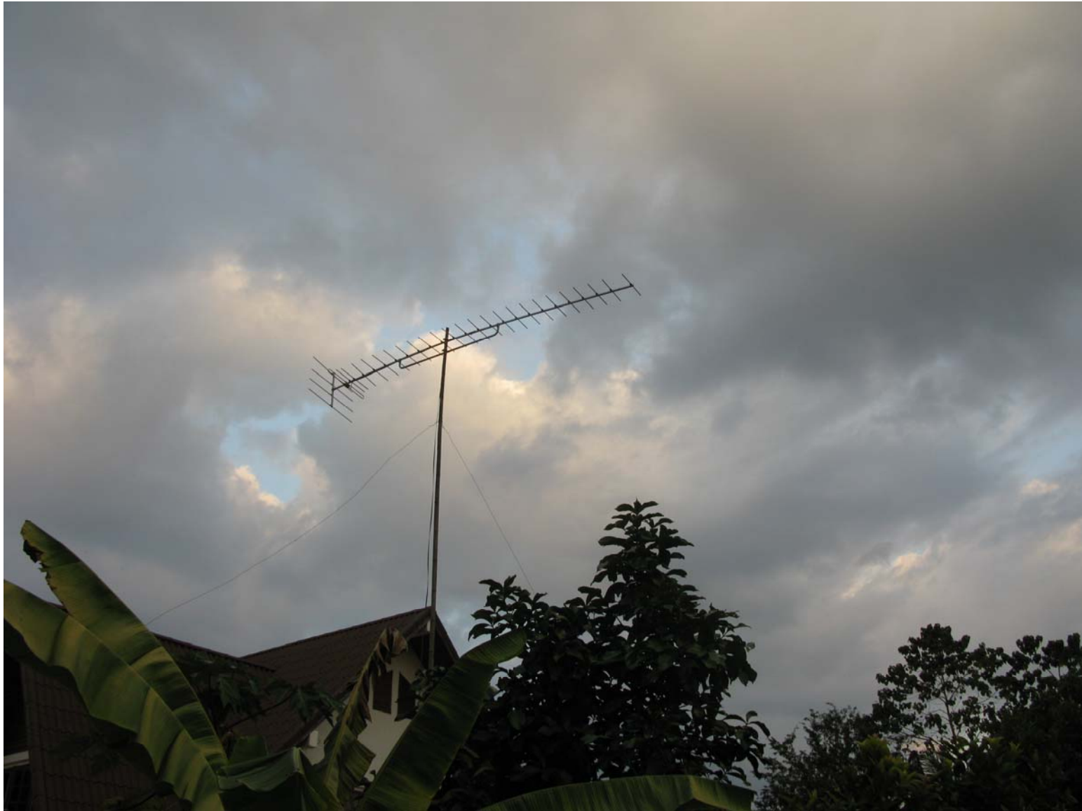
Rural Info Outreach: TV antenna on a bamboo mast