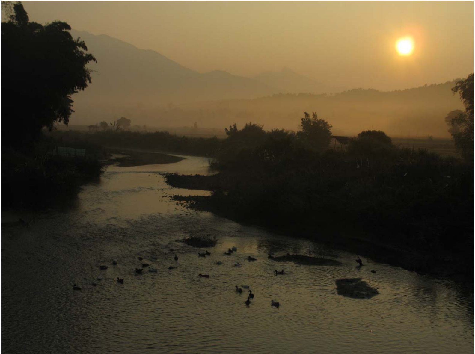
Ducks at Dawn on the Nam Yang