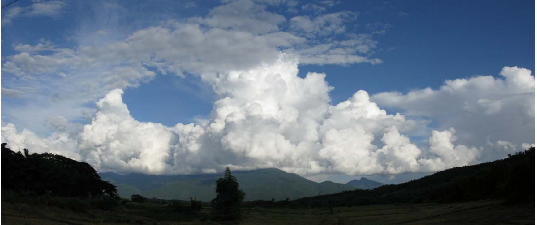
Clouds towering over Doi Phu Kha