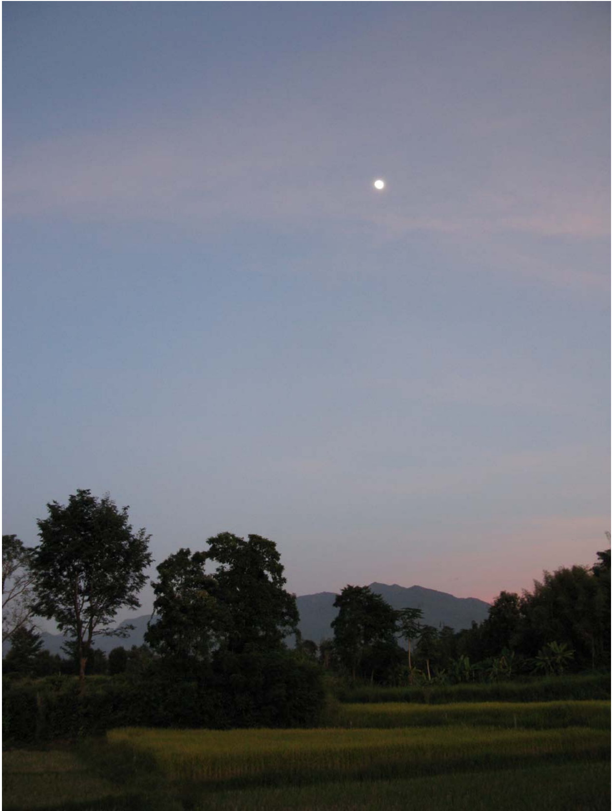
Early evening moon over Ban Na Fa