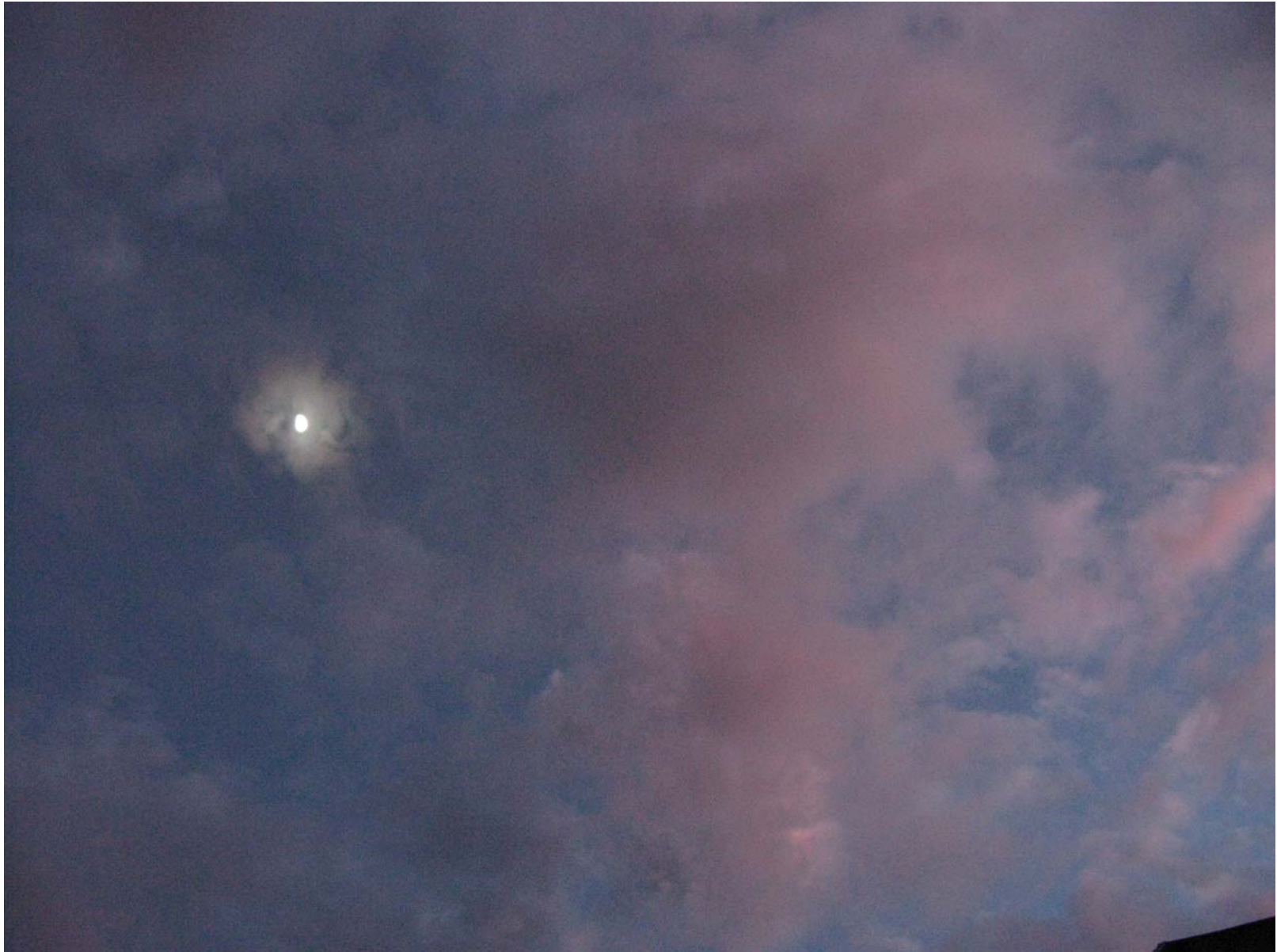
Early evening moon over our farm