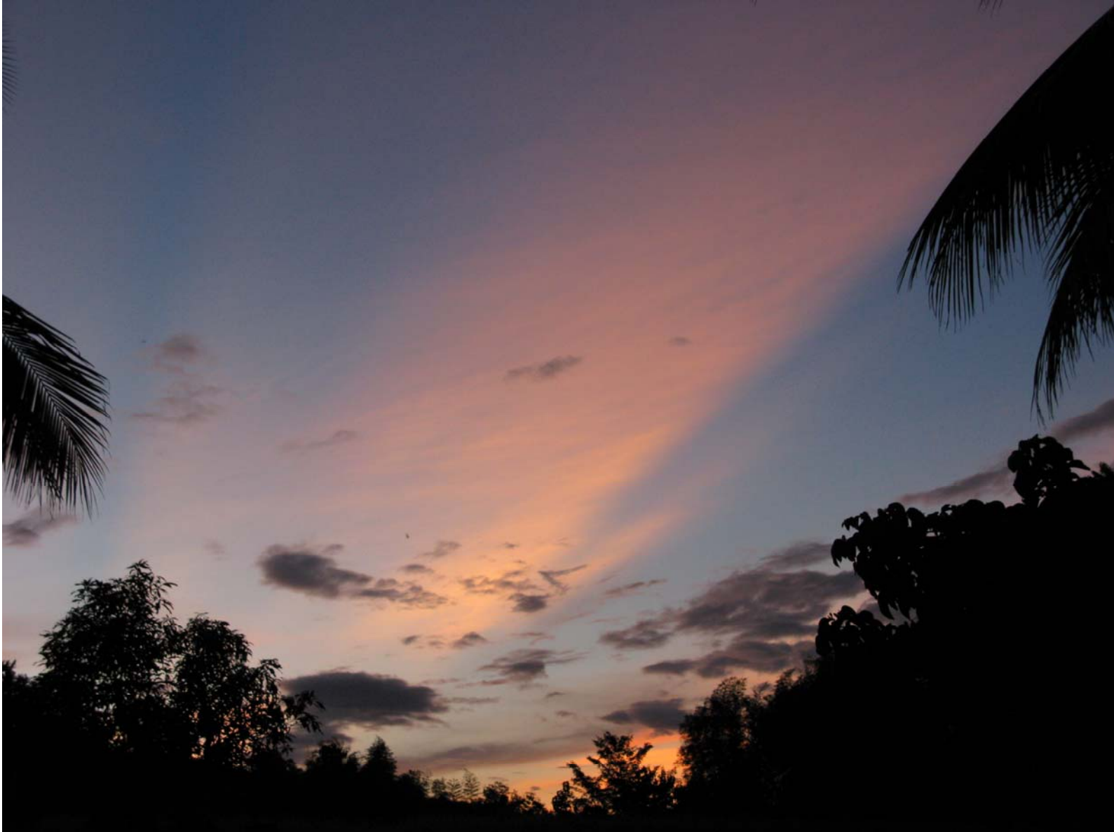
Sunset at our farm