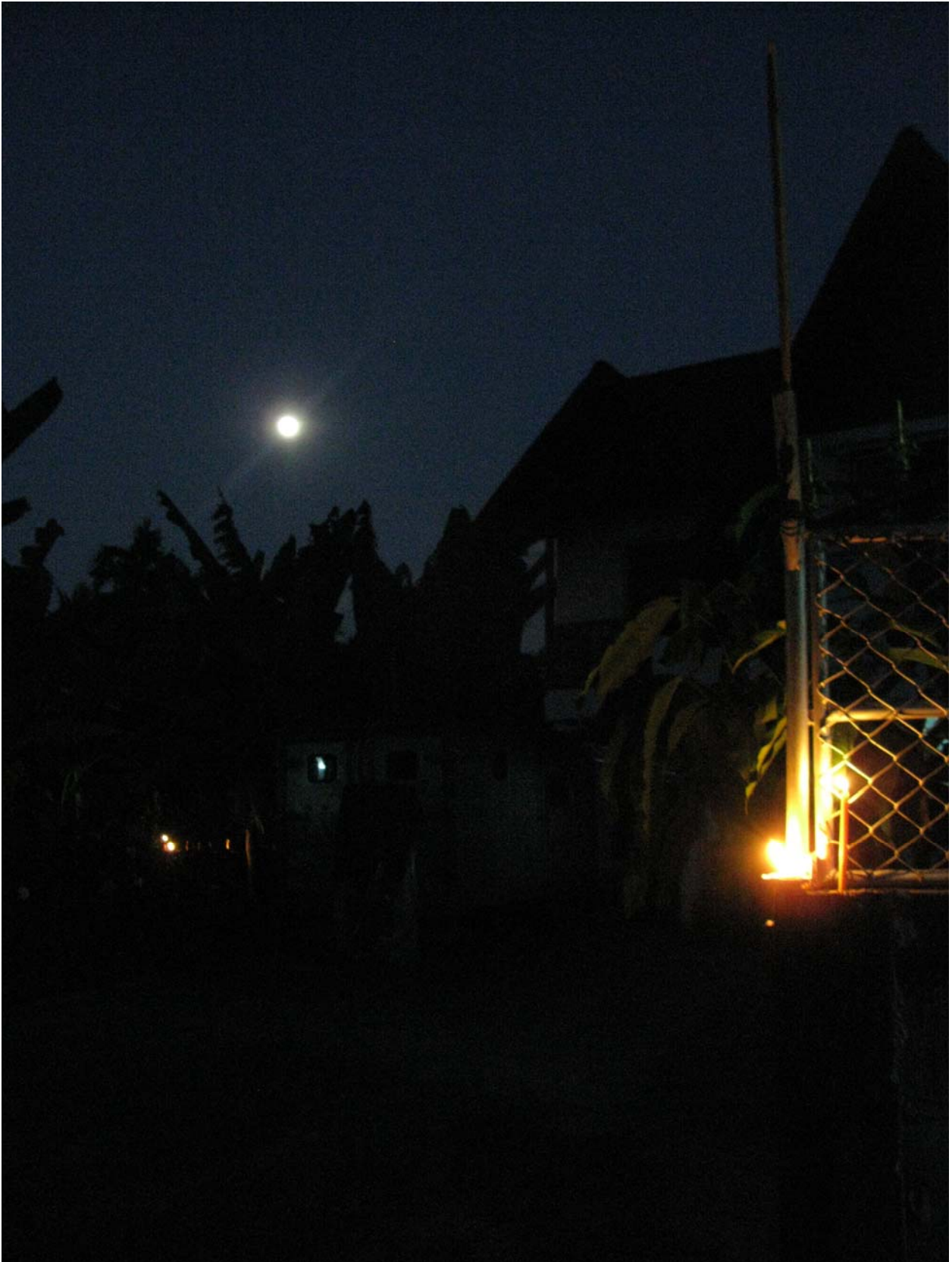
Moon and Candle for Loi Khathom