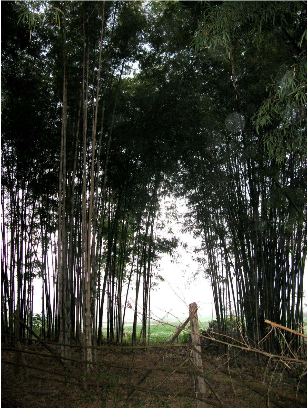
Misty Morning Bamboo