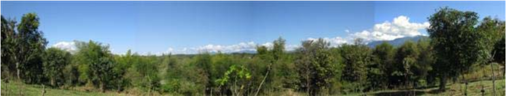
Vista from our Hill Top parcel looking to the NE