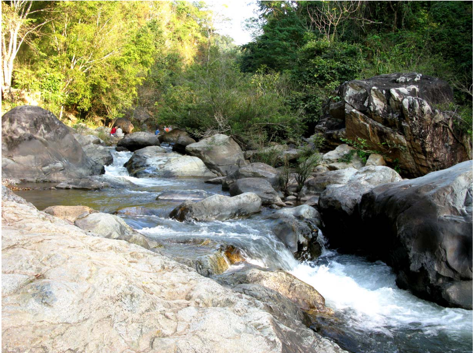
Silaphet Waterfall: Headwaters of the Nam Yang