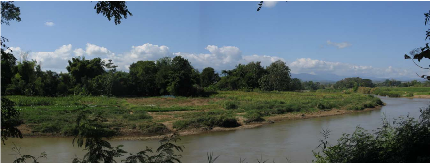
Nan River looking Northwest at Thawangpha