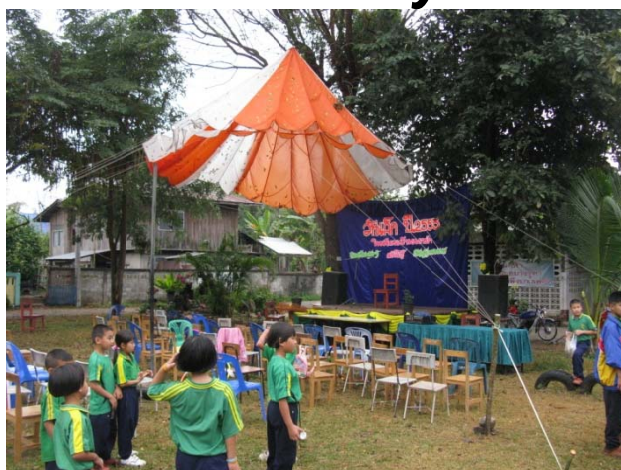
A parachute canopy for the outdoor stage.

January 8, 2010 was Children's Day at Ban Na Fa Elementary School. The RTC-TH donated food treats for the children and provided photography services for the event. The one day event was filled with a variety of activities: awards presentations, group and individual competitions and games, and a gift exchange.