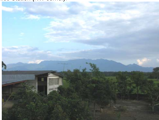
View of Doi Phu Kha to the Southeast