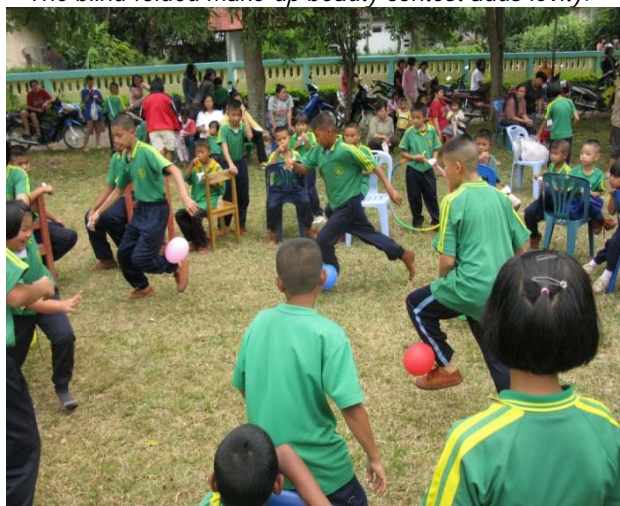
The adrenalin rush of a good balloon stomping contest.