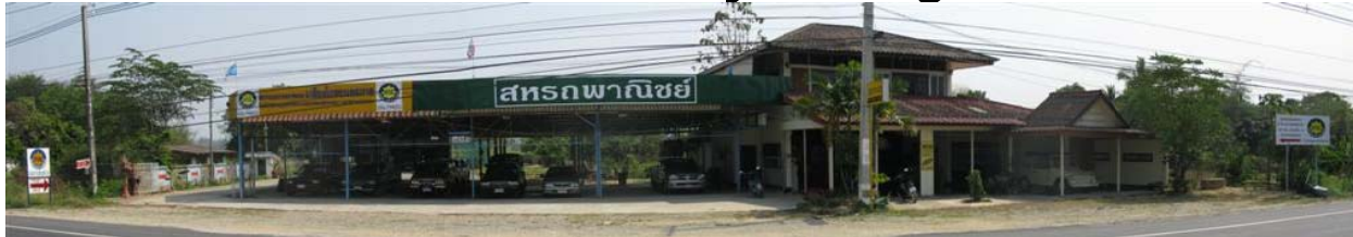
The smog check service is located at the major highway intersection in northern Nan Province.