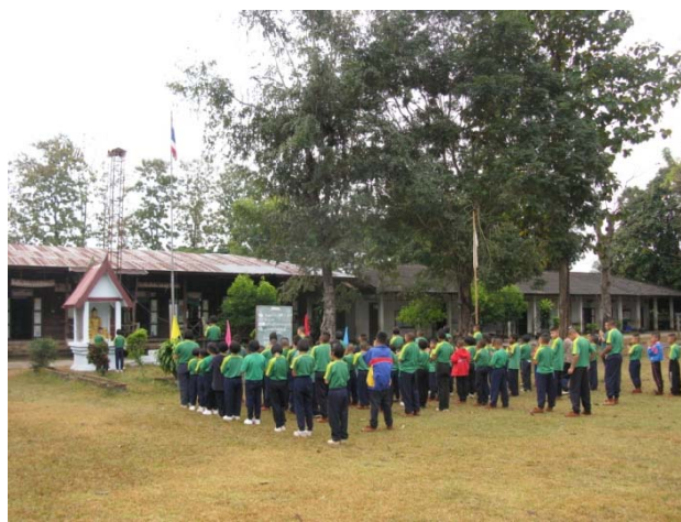
The students assemble for the flag raising and morning prayer.