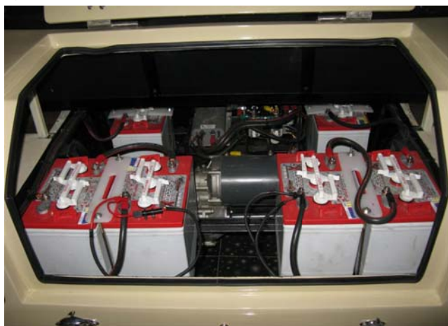
“Sparky” carries 8 batteries (~1000 amp hrs of power); 2 batteries in front, 2 midships, 4 in the rear.