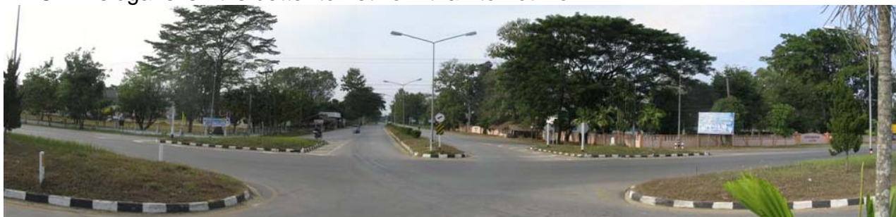
Located at the largest highway junction in Northern Nan Province, across from the District government offices (SW corner) and the District Police Station (NW corner).

The location was also a prime consideration for us. Directly across the highway are the District government offices, the District Police Station, Post Office, Water Department, and Telecommunications Tower. This physically positions us for networking with these government offices for future RTC-TH training programs and EmComm (Emergency Communications) efforts. As many of you know, one of our RTC-TH slogans is "It is better to network than to not work."