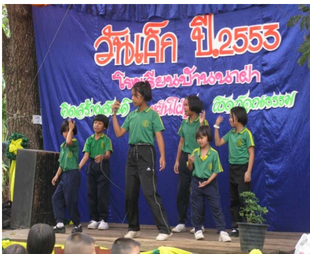
A song and dance competition between groups of mixed grades.