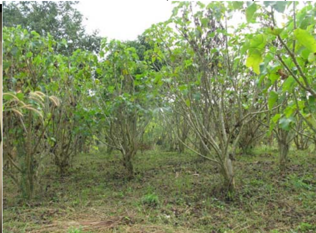
We plan to use Jatropha SVO to generate electricity on the farm.