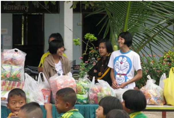
Former students volunteer and assist their teachers in the many tasks and activities.