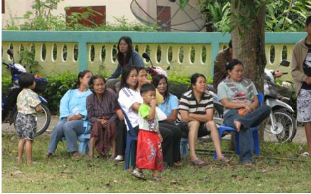
Families sit on the sidelines as spectators and share in the excitement of Children's Day.