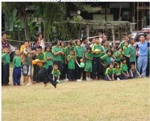
A water balloon relay race gets everyone excited.