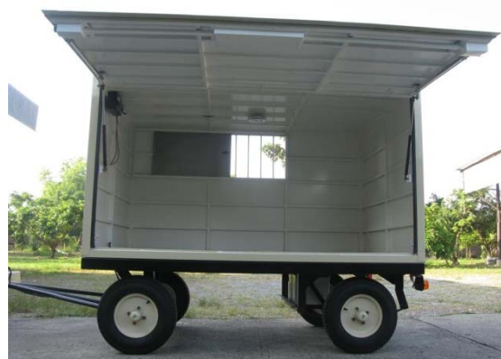
“Sam” carries 2 batteries (~250 am hrs of power)