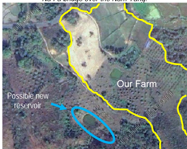
A new reservoir is being planned next door.