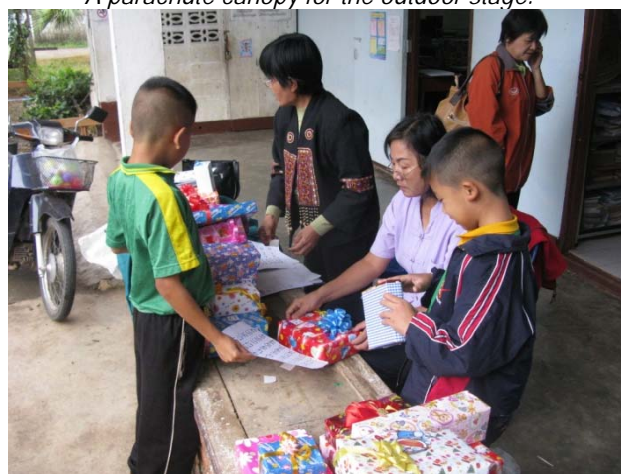
Students and teachers prepare presents for the gift exchange to take place later in the day.

As the day progressed, families stood by as spectators with younger siblings not yet in school joining the students. Former students also attended and assisted teachers.