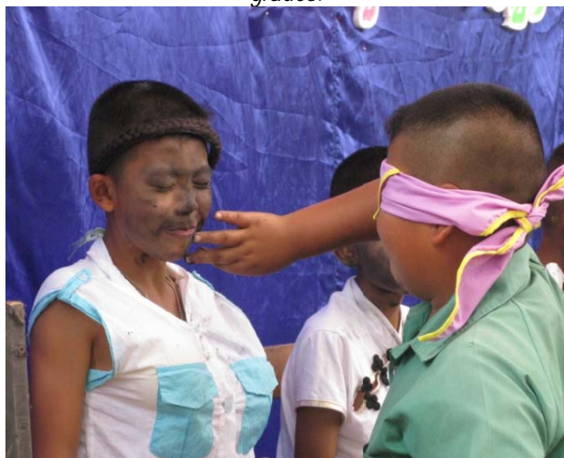
The blind-folded make-up beauty contest adds levity.