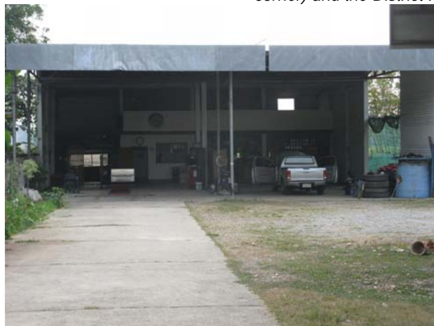
The Vehicle Inspection facility/building.