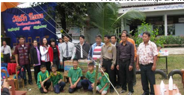
School officials, local village leaders, and visiting government dignitaries attend Children's Day.