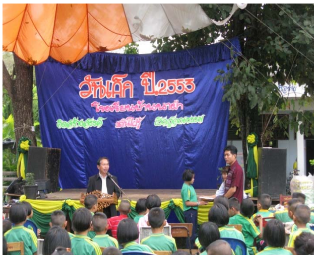
The event begins with presenting various students with recognition awards.