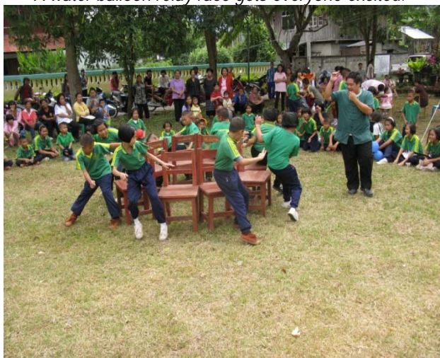
Musical chairs is among the fun and games.