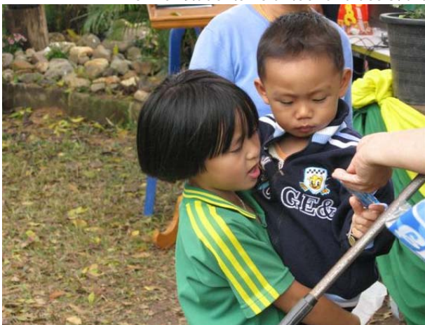
Pre-school siblings are welcomed to join the festivities.