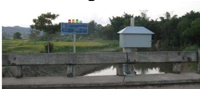
An automated wireless stream gauge installed on the Ban Na Fa bridge over the Nam Yang.