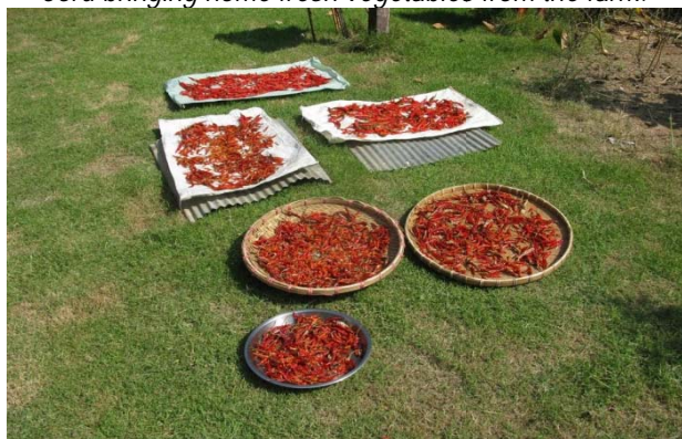
Sun drying the chilies from our home garden. The farm garden supplies chilies for the farm kitchen.

From the garden and farm, we are thankful for an abundant, safe, and nearby food supply. Since we are not farming commercially, we don't put a monetary figure on the value of our crops. Instead, we focus on the value of the intangible measures of "happiness, satisfaction, sense of security and well-being" and similar quality of life impressions. We consider personal satisfaction and comfort to be "priceless." And our food supply is a few footsteps from the kitchen door.