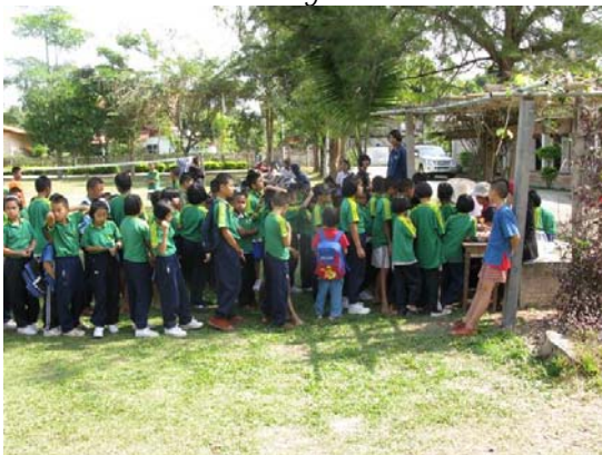
I scream, you scream, we all scream for ice cream.