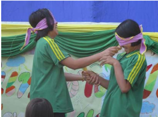
Blind fold banana eating contestants in action.