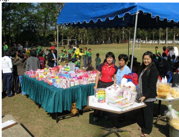
Children's presents and donated school supplies.

and 60 pencil boxes with a pen were added as prizes for the various activities the teachers planned for the day. The RTC-TH also donated another parachute to the children's playground equipment inventory.