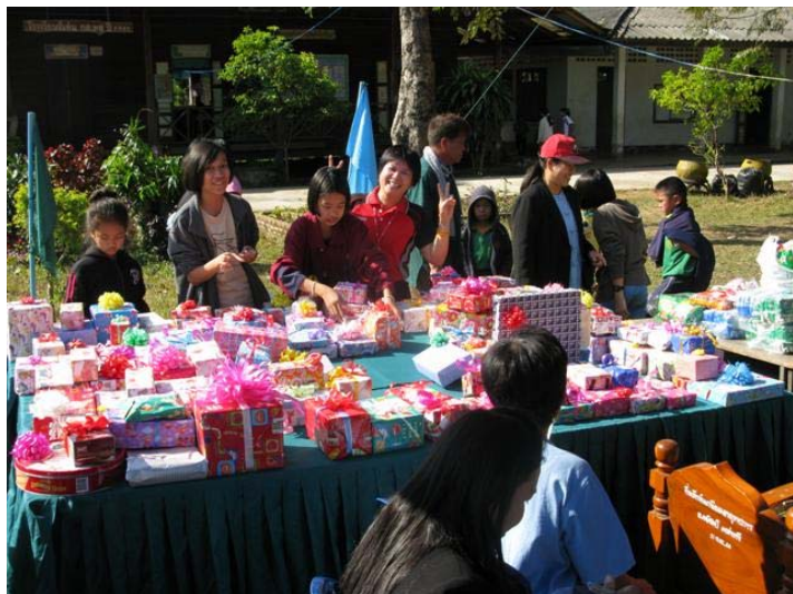
Each student brought a gift for another student.

The air was filled with electric excitement akin to Christmas. The students were anxious to get started, curious about the presents, wondering about their chances to win prizes. Some of them had to be wondering why every school day couldn't be as exciting as this!