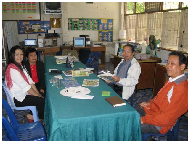
RTC-TH & Na Fa Elementary leaders in a planning meeting.