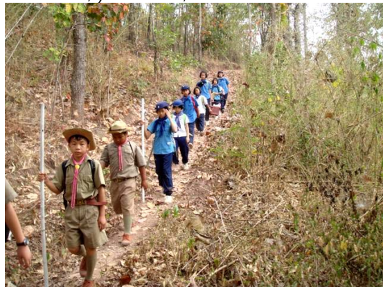
The annual Boy Scout / Girl Guide hike was also part of the activities. This year, they prepared lunch in field.