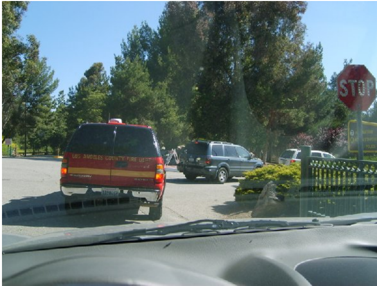
Fig 1. Recon Caravan leaving Park Headquarters