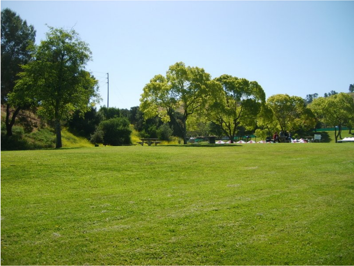
Fig 9. This view is facing East . Notice the picnic table at right end of our assigned area. See event map.