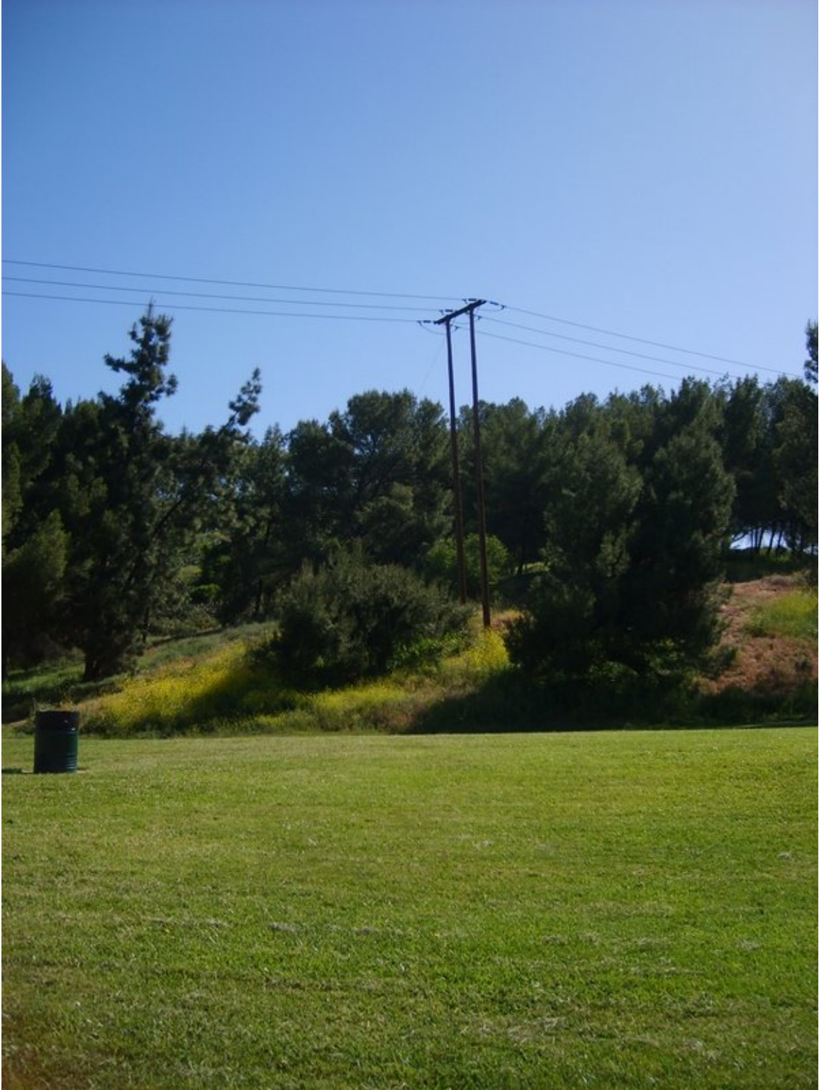
Fig 7. This view faces North . Notice the power lines overhead that we must avoid being under.