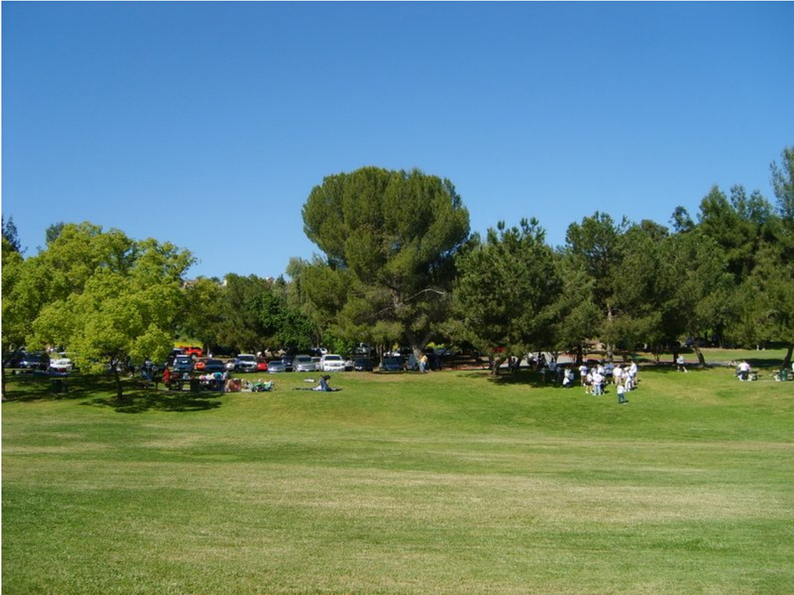
Fig 10. This view, taken from the approximate location for our station is facing South West toward the parking area.