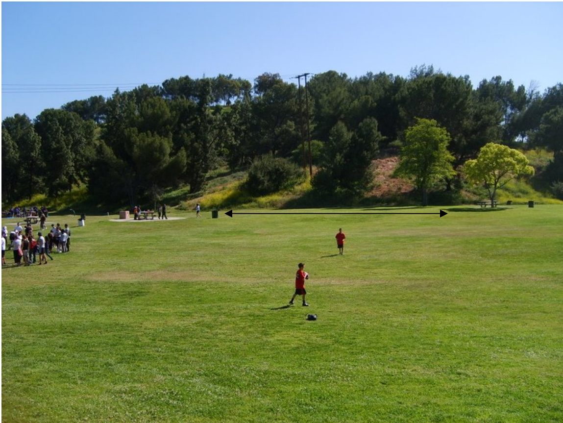
Fig 3. Area for GERC radio operations is on a lawn area at the West Valley. Jim Dowdle has permission to park his motor home right on the grass! Arrow roughly indicates the area we are assigned. Notice the two boys in red shirts playing on a slight upward slope, but the area behind them is very level. In my opinion, despite the hill in the background we have been assigned a very good location. There is much more room than is apparent in the photo. Also see the arrow on event map (Fig 4 & 5) below.