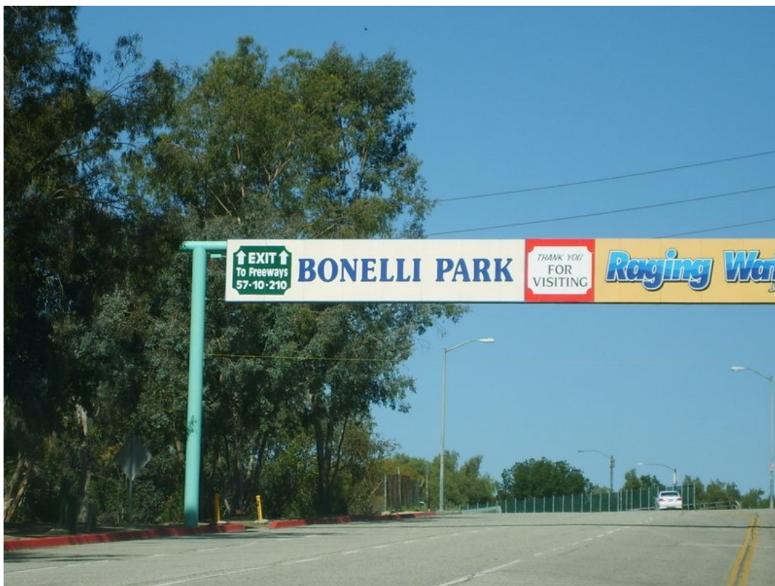
Fig 11. All in all we are very impressed by the accommodations that the Scouts have given GERC, and look forward to seeing many of our hams friends there. This is going to be so much fun!