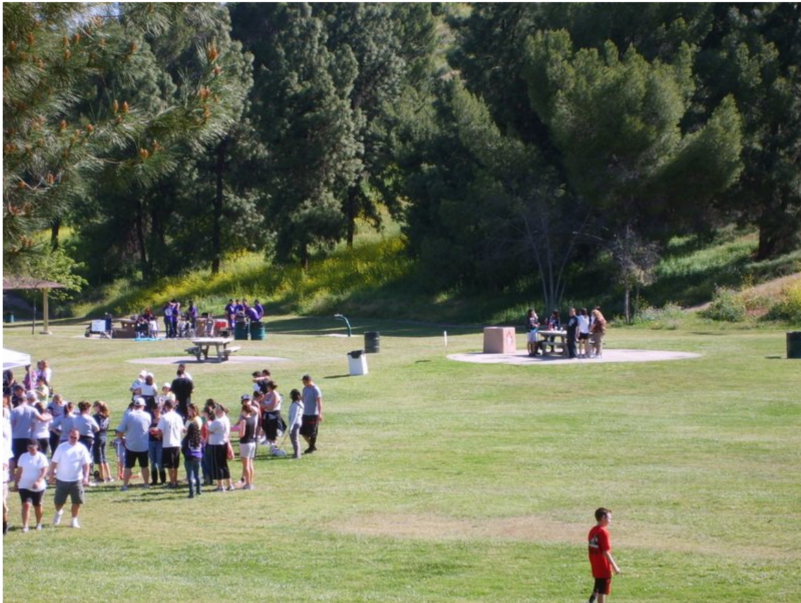
Fig 8. This is the picnic pad on the West end of our assigned area. See map enlargement.