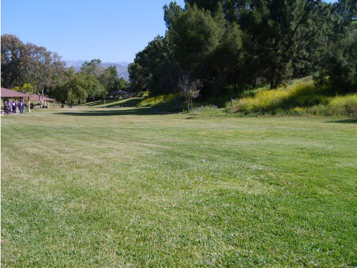
Fig 6. This view is facing to the North West . We must be careful about pounding stakes in the ground more than twelve inches because of irrigation pipes. We don't want any GERC hams to get the

"25 OHM AWARD" for 2010 and a repair bill from Los Angeles County!