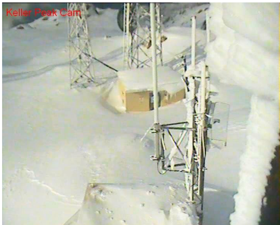
Storm has passed through on February 10, 2010 leaving a lot of snow