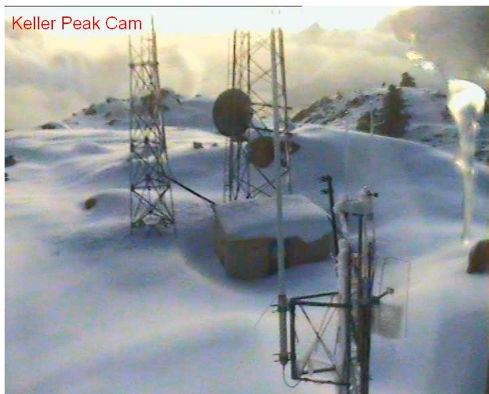
Keller Peak N6WZK Repeater location on Feb 8, 2010. Repeater is in building in center and antenna is at top of tower on the left.