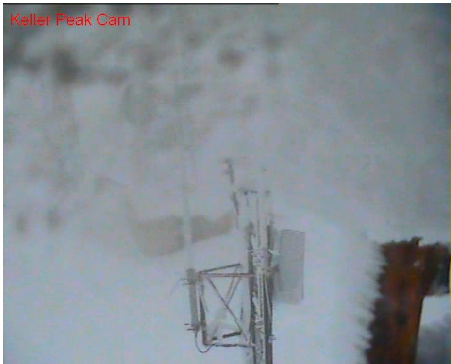
It's a blizzard on Feb 9, 2010