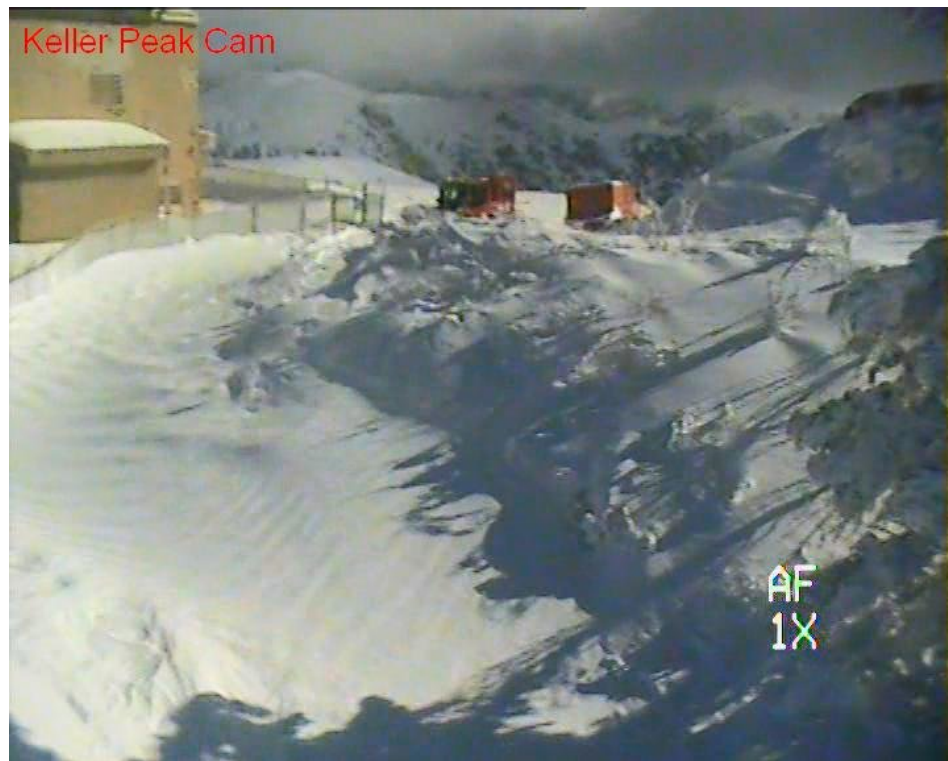
Service vehicles at Keller Peak on February 10, 2010