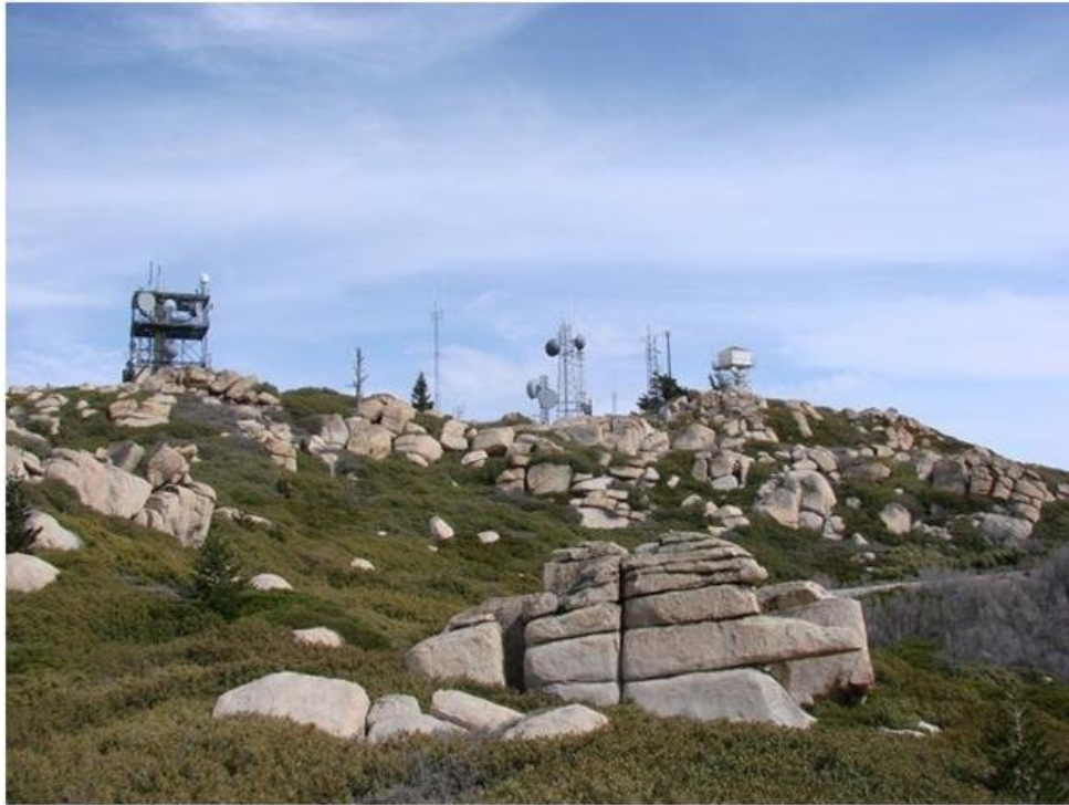
Keller Peak in the summer