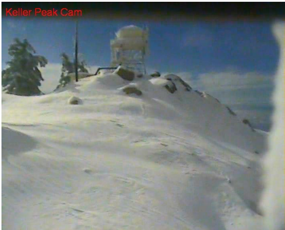
Keller Peak Lookout on February 10, 2010