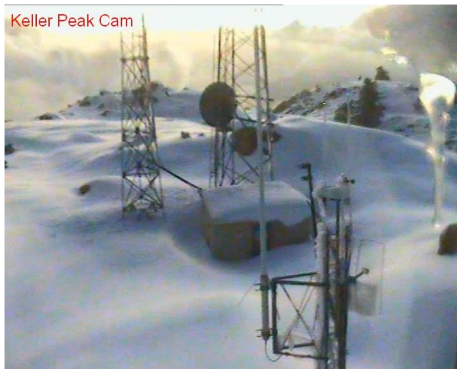
Another view of N6WZK repeater location on Feb 8, 2010