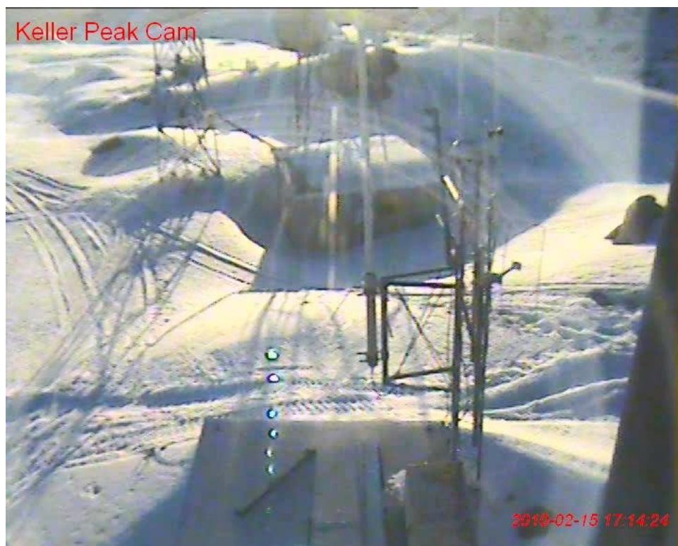
February 15, 2010