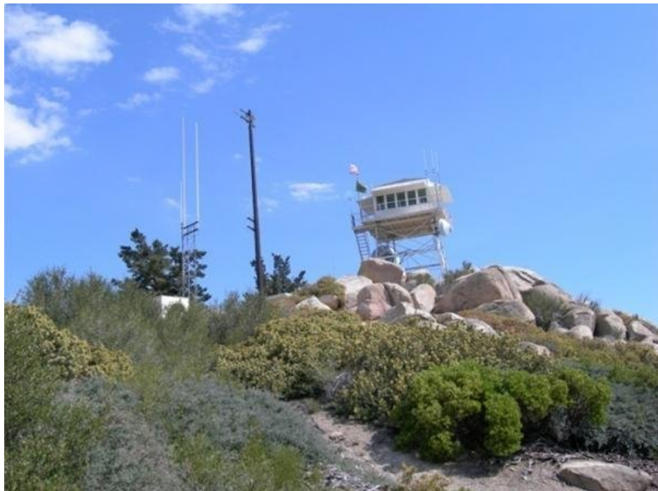
Keller Peak Lookout in the summer