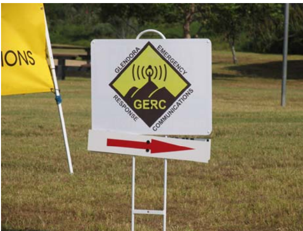
Sign points to road that leads uphill to Field Day site