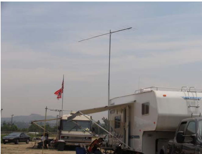
2 meter yagi antenna