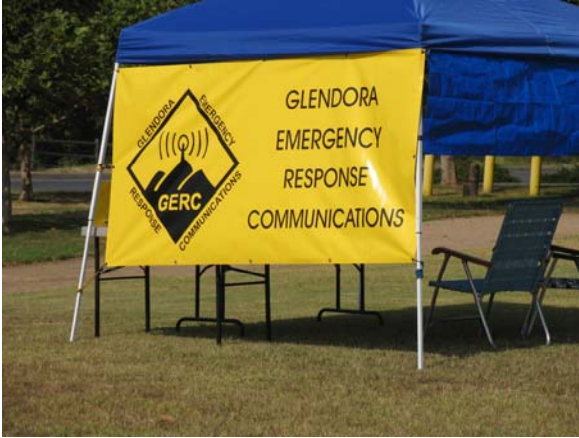
Information table near entrance.