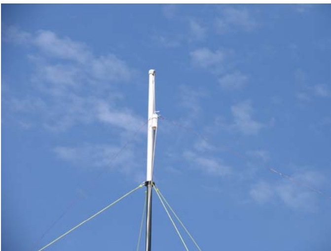
1:1 Balun connects the dipoles