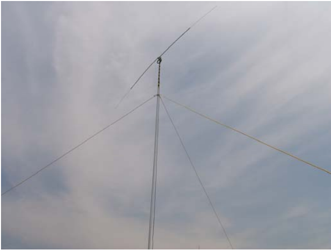
Rob's 20 meter dipole antenna really brought in the stations!