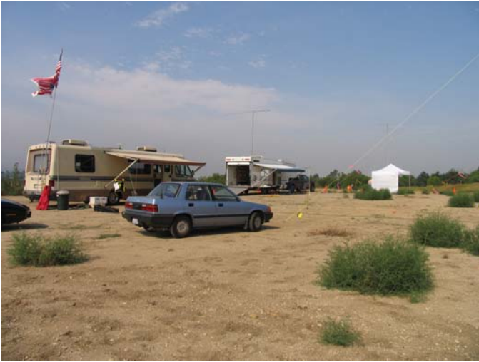
RV's are set up