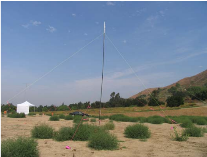
Mark's 36 foot mast supports a 40 meter inverted V dipole antenna