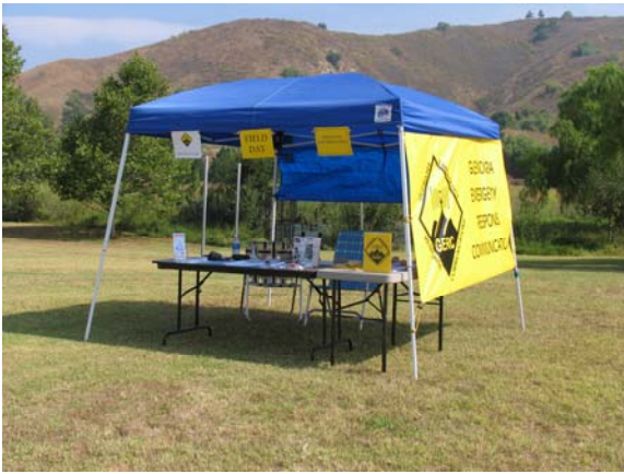
Information Table – Awning blew over in a wind gust later in the day.