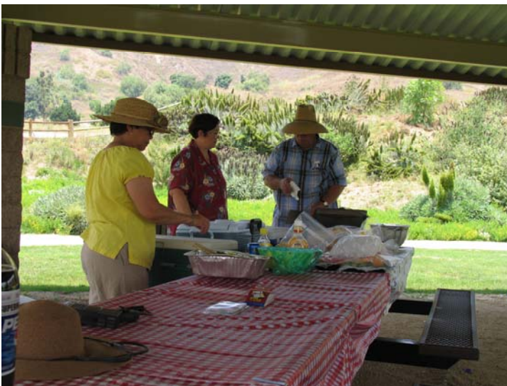
Lunch is served!