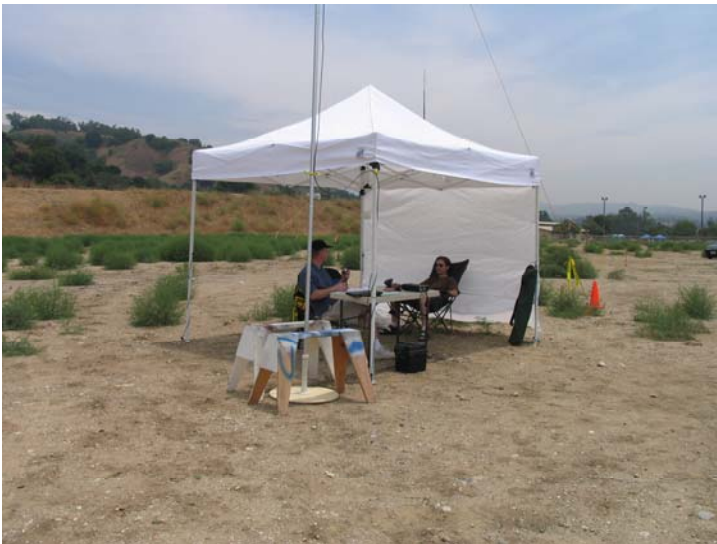
It was soooo HOT!