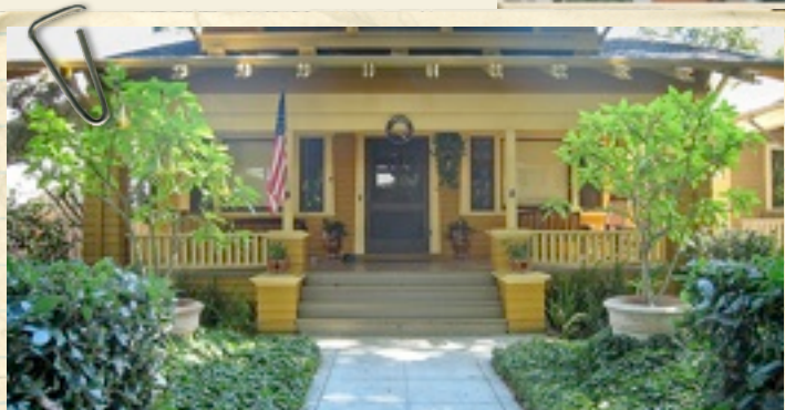
Upcoming 2011 Timrod Park Neighborhood Home & Garden Tour - See Page 2 for details

New officers will be chosen at the April Association Meeting. April 6th in the Billy Jeffers Center-Timrod Park at 7 PM. Dues of $15 must be paid prior to running for office.