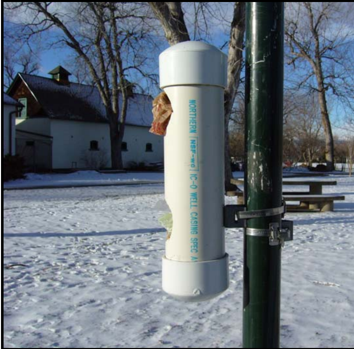
Dispenser in Washington Park (17” tall / 4” in diameter)