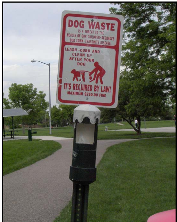
There are a variety of signs and dispenser in the parks.

Recognizing the need to address the dog waste concerns in Denver parks and the desire to participate with the City in reducing budget costs, we propose the following plan to