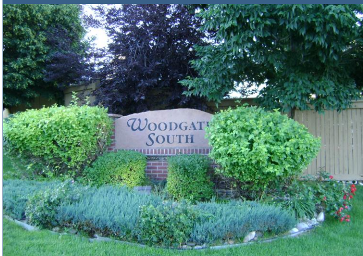
Woodgate South Aurora, CO