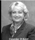
Consider It Sold!

Century 21 Carole Realty 7676 Hazard Center Dr., Ste 100 San Diego, CA 92108