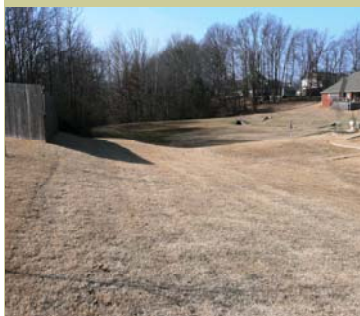
CastleRidge Retention Bay and Common Area on Sir Galahad. Our New Sight for Neighborhood Events!

We're on the web! www.castleridgehoa.org