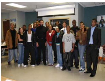
These phenomenal youth are being recognized as graduates March 15, 2008 at the Columbus Urban League