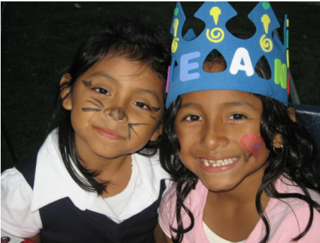
Face painting and craft projects are always a hit.