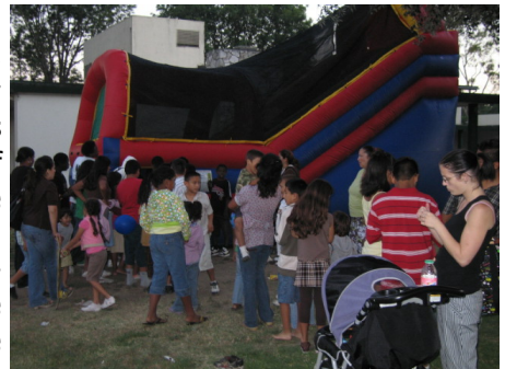
A bounce house always draws a crowd