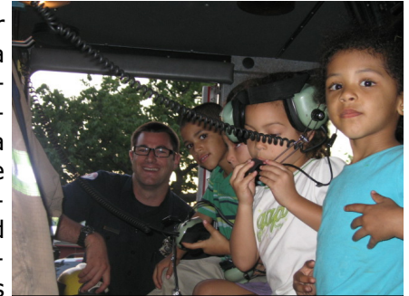
Our newest firefighters