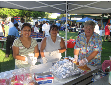
A LOT of free food at Summer Fest!

Fire Safety House. Accompanying the equipment were approximately seven Fire Ambassadors and five Fire Fighters.