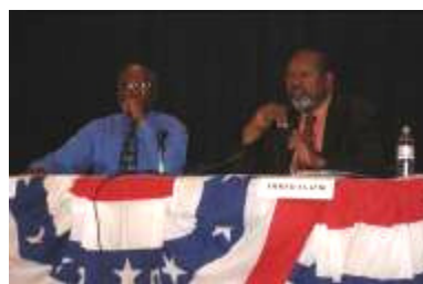
6th District Council Candidates at Forum, Photo: Neena Strichart, Signal Tribune