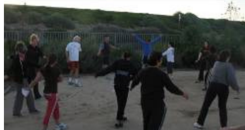
River Runners 1st warm up