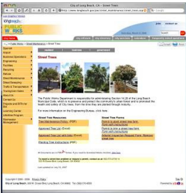
Long Beach website for street trees

While it is important that we preserve as many of our mature trees as possible, trees will inevitably be lost to old age, disease, and weather. Even with our extended growing season it takes many years for trees to reach a functional size. This is why it is vital to plant now to insure that Wrigley will continue to enjoy the benefits of a leafy canopy.