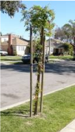
A recently planted street tree

This month we are shifting focus away from Wrigley's old growth urban forest. As one drives or walks through our neighborhoods it becomes obvious that there are far less trees than there once were. Over time trees are lost due to old age, disease, weather, and lack of proper care. This month we are focusing on the process of replacing missing parkway trees (the parkway is the area between the curb and the sidewalk). Many people are under the impression that, since the City is responsible for the maintenance of parkway trees, only the City can replace missing trees. This is not the case, and the City actually welcomes any resident assistance with tree replacement. Groups such as Wrigley is Going Green will continue to obtain grants for tree planting, but some areas are not included in the grant boundaries. All the Public Works Department asks is that trees be planted in accordance with their guidelines.