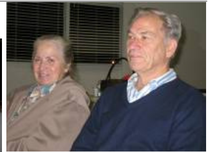
Photos from March election forum

Top left, school board candidates