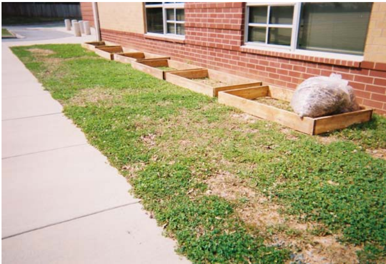
Planting boxes in courtyard