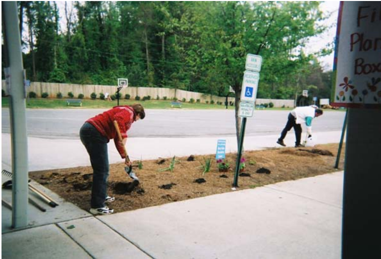
Merry Oaks teachers begin.