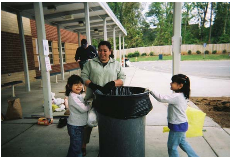
Parent and student volunteers