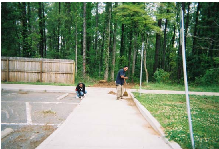
New trail entrance