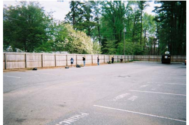
Merry Oaks parking lot beautification