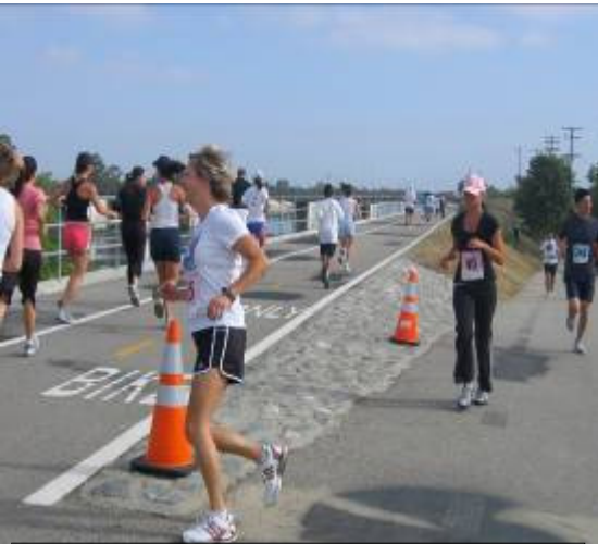
Runners Enter the River Trail in the 10k

The support we received for this event shows that there is a demand for family-friendly community events in this city outside of Downtown and Belmont Shore, where the overwhelming majority of events in Long Beach currently take place.