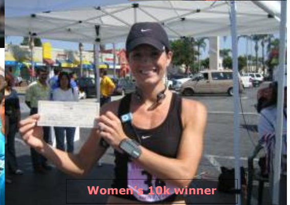
Women's 10k winner