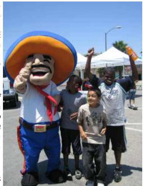
Neighborhood Kids with Sr. Tacos Don Chente