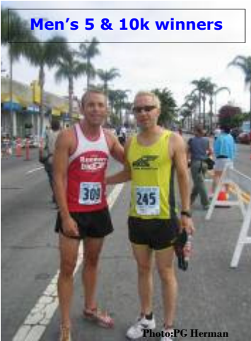
Men's 5 & 10k winners

More Pics at www.wrigleyriverrun.com