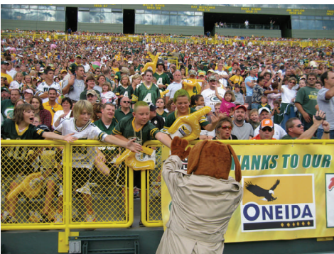
Looks like it was a full house!