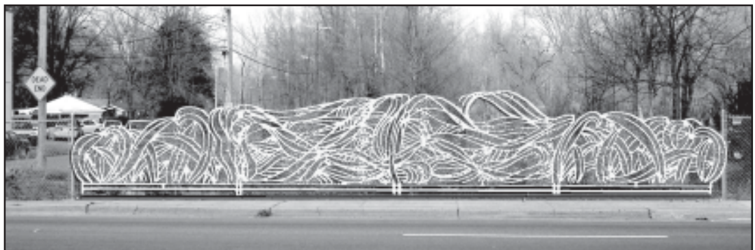
Public Art Project On Central Avenue