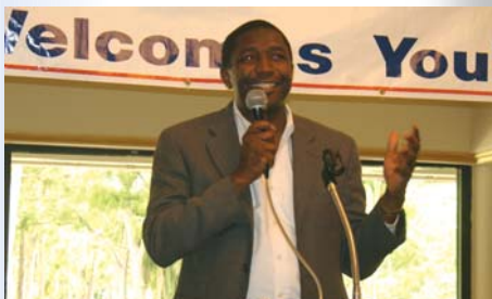
Vice Mayor Holness thanking the devoted volunteers at Lauderhill's Volunteer Brunch '06.