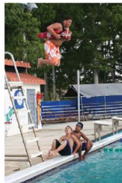
The Junior Lifeguard Camp - there were many exciting practice sessions in the swimming pool.