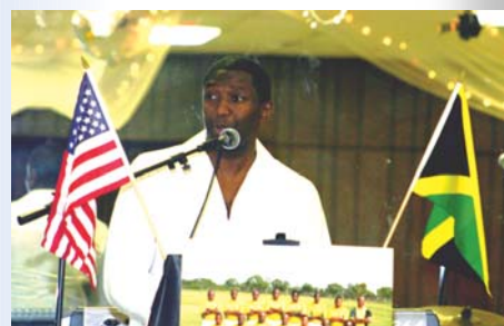
Vice Mayor Holness addressing the assembly celebrating Jamaica Independence Day in Miami.