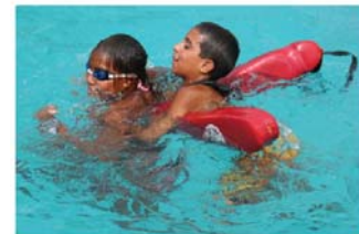
The Junior Lifeguard Camp is a first experience for 11-15 years old boys and girls in the aquatics environment.

For more information please call: Veterans Park at 954. 572.1459