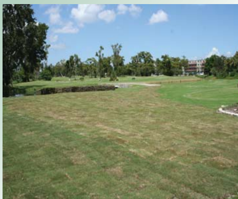
Newly Installed cart path at the Pro Shop