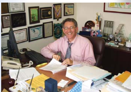
Mayor Kaplan at work from his desk at City Hall.