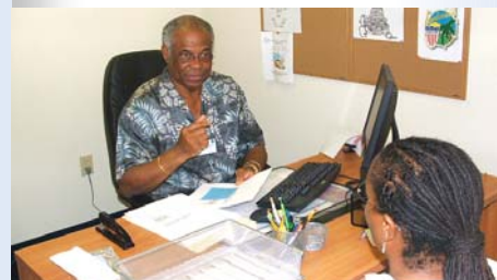
Commissioner Benson takes time out of his busy schedule to meet with a Lauderhill resident.