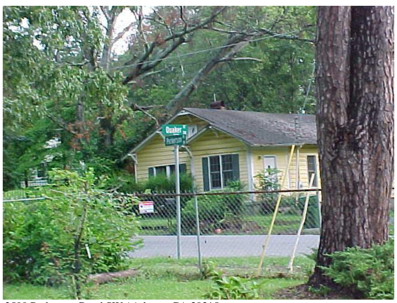
2500 Perkerson Road SW / Atlanta, GA 30315

Located at 2500, 2507 & 2512 Perkerson Road Atlanta, Georgia 30315