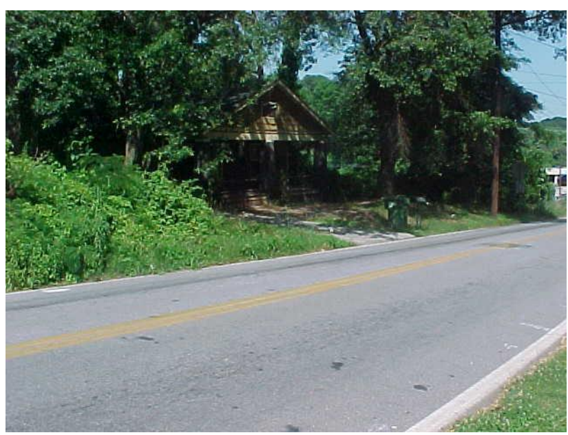
Prior to July 2010